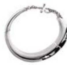
For the minimalist on your shopping list, a strong collar necklace in gleaming silver is a party season power move. BIKO NECKLACE, $485. ILOVEBIKO.COM