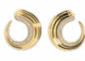
Delicate sparkles adorn golden swirls on these statement earrings that could easily be mistaken for a vintage family heirloom. LILI CLASPE EARRINGS, $251. LILICLASPE.COM