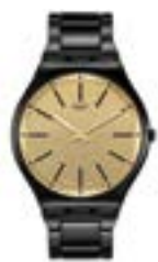
A charming gold face gives this brushed-black stainless-steel watch just the right amount of retro playfulness.