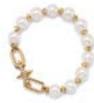
Freshwater pearls are anything but traditional when strung with 18K-gold spike rondelles and finished with a diamond clasp. TIFFANY & CO. BY PHARRELL WILLIAMS BRACELET, $21,400. TIFFANY.CA