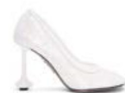
Tuck that trusty sequin dress away this holiday season and let your gams do the, uh, legwork in a pair of fashion-forward spangled pumps. LOEWE SHOES $1,910. LOEWE.COM