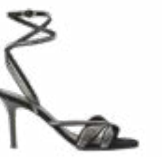
Make like a Parisienne and wear these sandals with sheer black tights and a long-sleeve mini-dress for a look that's more Isabel Marant than Emily in Paris . BA&SH SHOES, $515. BA-SH.COM