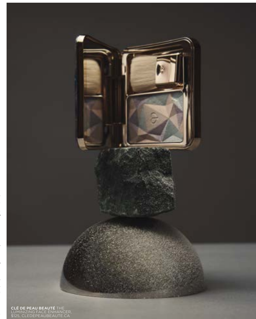
CLÉ DE PEAU BEAUTÉ THE LUMINIZING FACE ENHANCER, $125, CLEDEPEAUBEUTE.CA