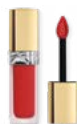
Like tinsel for your pout, this longwear liquid lipstick magically takes on a glittery finish when lips are pressed together. Frost yourself! DIOR ROUGE DIOR FOREVER LIQUID SEQUIN LIPSTICK, $65, DIOR.COM