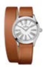
Two elegant drips of diamonds, a sleek chestnut leather double strap, roman numerals on the watch face—oh, she's fancy.

FREDERIQUE CONSTANT WATCH, $1,595, FREDERIQUECONSTANT.COM