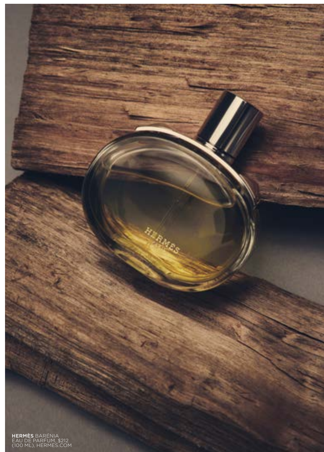
HERMÈS BARENIA EAU DE PARFUM, $212 (100 ML), HERMES.COM