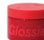
Glossier's It girl scent is now a lush body cream whipped out of shea butter and jojoba oil. The red glass tub brings subtle cheer to the vanity. GLOSSIER CRÈME DE YOU DRY-TOUCH BODY BUTTER, $61, SEPHORA.CA