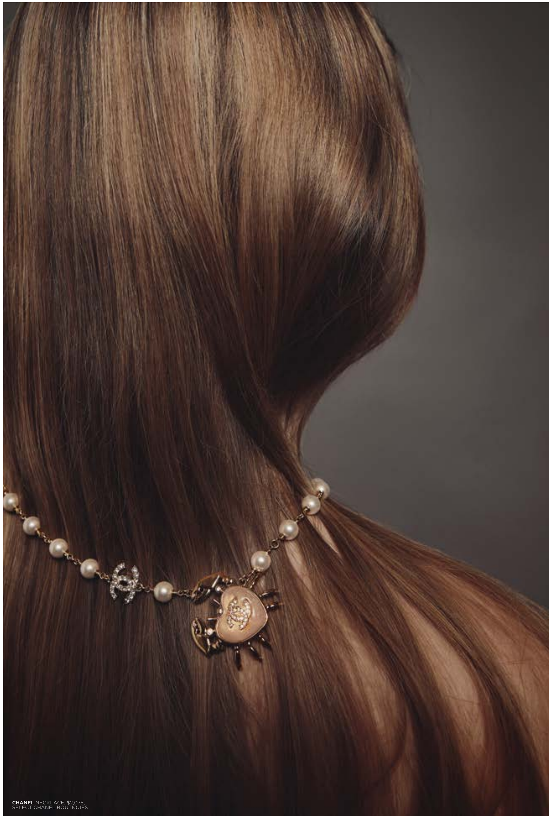
CHANEL NECKLACE, $2,075. SELECT CHANEL BOUTIQUES