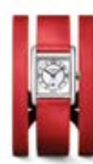
A pop of red is perfect for gift-giving season but chic all year round, especially when it's in the form of this cerise multi-strap, Swiss-made timepiece.