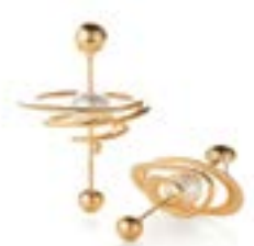
Party season might be the time to let one's hair down, but these new galactic earrings demand to be seen, so updo it is. JENNY BIRD EARRINGS, $168. JENNY-BIRD.CA

Whether you're booking it south for a mid-winter break or just holding out the months until we can dust off our sundresses again, joy-giving jewellery is delightfully seasonless, free from the trappings of the Gregorian calendar. We bet Rapunzel would approve.