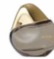
The beloved minimalist makeup brand now makes perfume. It starts clean, opens with a floral centre and finishes with a vanilla-musk dry-down. MÉRIT RETROSPECT L'EXTRAIT DE PARFUM, $125 (30 ML), MERITBEAUTY.COM