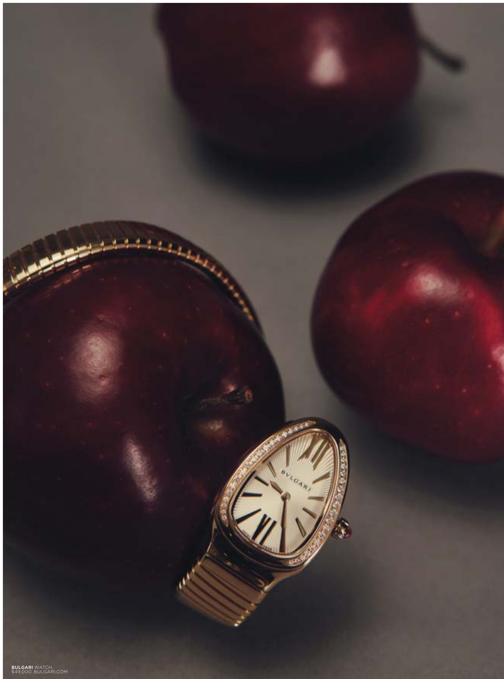
BVLGARI WATCH $49,000, BVLGARI.COM