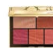
Come for the jazzy gold compact, stay for the luminous powders that highlight, sculpt and blush the entire face. NARS PURE LUXURY LIGHT REFLECTING FACE & EYE PALETTE, $81, SEPHORA.CA