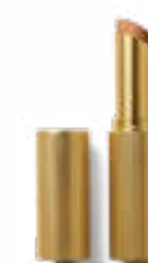
Spice up a stocking with a gem from Victoria Beckham's buzzy brand. This hero highlighter stick imparts a dewy slick without a hint of glitter. VICTORIA BECKHAM BEAUTY REFLECT HIGHLIGHTER STICK, $55, RENNAI.COM