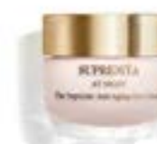
This splurge-y eye cream addresses drooping, puffiness and dark circles (the unholy trinity of holiday fatigue). It comes with a lovely massage tool. SISLEY SUPREMYA ANTI-AGING EYE CREAM, $520, SISLEY-PARIS.COM