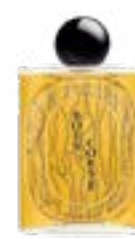
Black coffee, tonka bean and cedar merge in this scent that was inspired by tree bark and smells like you've just bitten into a slab of opera cake. DIPTYQUE BOIS CORSÉ EAU DE PARFUM, $446 (100 ML), HOLTRENFREW.COM