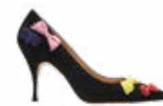
Black suede pumps are anything but basic when decorated with unserious bows that channel baby barrettes. The evil stepsisters could never! COACH SHOES, $270. COACH.COM

They'll look decidedly more avant garde paired with a sheer gown than a petal pink leotard; do add white tights for an extra helping of coquettish charm. And while Cinderella's transportation may have turned into a pumpkin at midnight, these sturdy curved lucite heels will allow the urban princess to dance all the way to the after-party. New Year's Eve shoes, anyone?