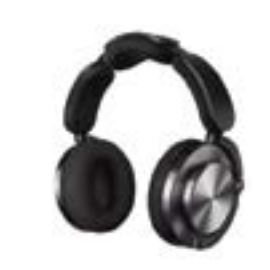
These headphones combine crystal sound quality with 55 hours of playtime. You can customize their look with interchangeable ear cushions and outer caps. DYSON HEADPHONES, $700, DYSONCANADA.CA