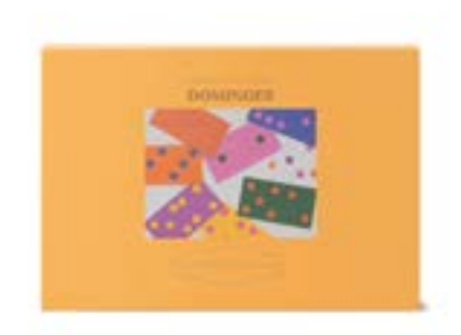
Turn games night into a celebration with this colourful domino set that adds a playful twist to the classic game Great for those who love to be the life of the party. DESIGNWORKS INK DOMINO SET, $55, GOODNBR.COM