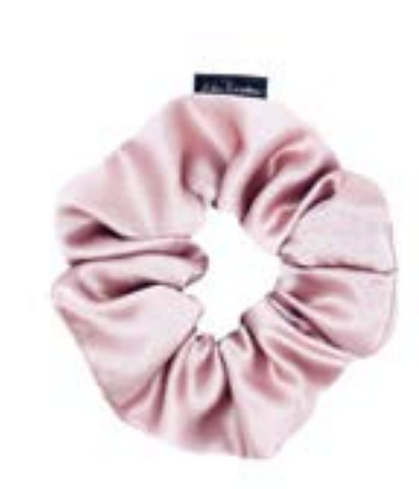
Crafted from "kokom" scarves (the Algonquin word for "grandmother"), this scrunchie adds a pretty touch to a ponytail or bun while supporting Indigenous craftsmanship AAIIN SCRUNCHIE, $11, AAIIN.COM