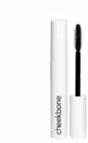
Party season prep is a breeze with this mascara from an Indigenous-founded brand that delivers bold lashes with its lightweight and clean formula. CHEEKBONE BEAUTY UPRISE MASCARA, $34, CHEEKBONEBEAUTY.COM