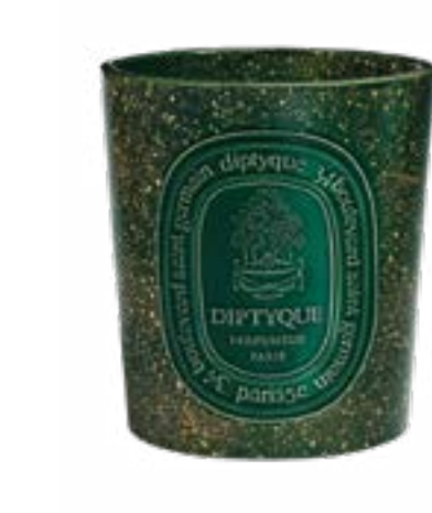
For the candle connoisseur, Diptyque's pine-scented version is a showstopper. The elegant vessel becomes a chic holder for makeup brushes or pens after the flame has burned out. DIPTYQUE CANDLE $588 HOLTRENEREW COM