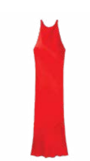
Bring main character energy to a holiday event with this gorgeous high-neck dress from Silk Laundry's latest collection. Hey, DJ, cue "The Lady in Red." SILK LAUNDRY DRESS, $420, SILKLAUNDRY.COM