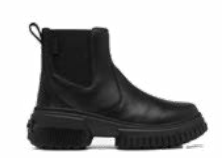
For the woman who refuses to choose between comfort and style during the winter season: a pair of waterproof leather Chelsea boots with treaded soles. SOREL SHOES, $200, SORELFOOTWEAR, CA