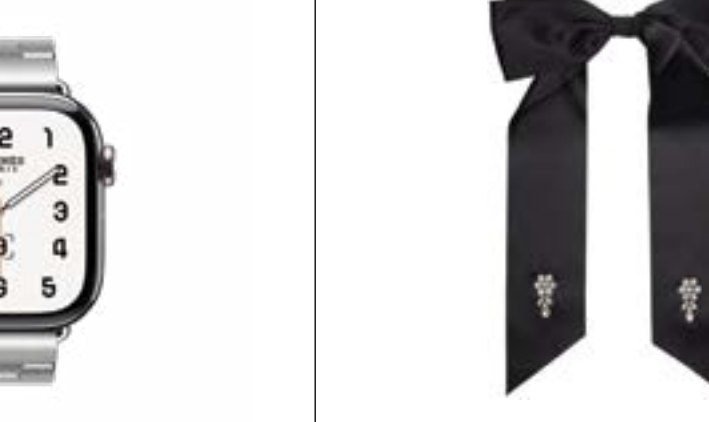
Upgrade their smart watch with the latest Apple Watch 10 Yes, bows are still very much a thing. This sleek black satin ribbon bow with crystal embellishments is the dreamy (Hermès version), which features stainless-steel links and "H" motif. Plus, it comes with a sports band for workouts. high-fashion hair accessory they didn't know they needed. APPLE WATCH HERMÈS, $1,699, APPLE,COM SIMONE ROCHA HAIR CLIP, $570, SSENSE, CA