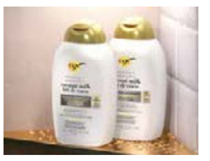
COCONUT MILK: DEEPLY HYDRATES FOR SMOOTH, SOFT HAIR, ENHANCED WITH A CREAMY COCONUT SCENT.