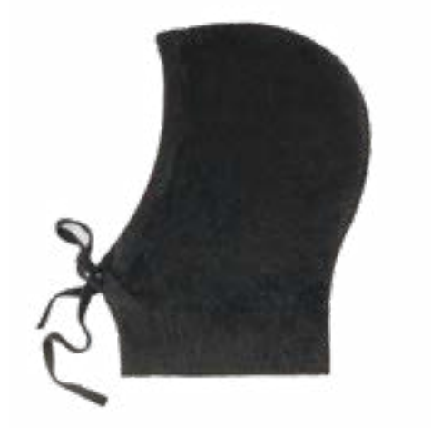
Canada's wind chill is no joke, but this functional and stylish knit balaclava will keep their head and neck warm in one go. They'll appreciate the snug fit to keep the cold out. COS BALACLAVA, $150, COS.COM