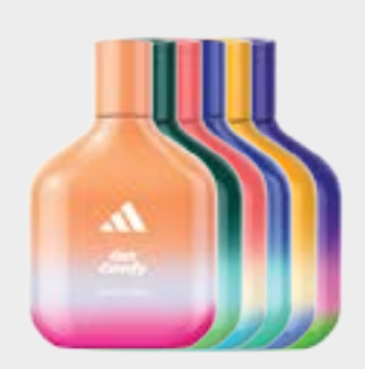
THE VIBE SETTER

BURBERRY GODDESS EDP INTENSE $216 SHOPPERSDRUGMART.CA