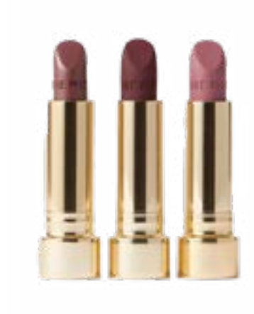
Editors rave about Merit's lightweight, buildable lipstick formula. This set of three new party-ready shades (all in different finishes) is perfect for those who love options. MERIT BEAUTY THE DRESS CODE SET, $78, MERITBEAUTY COM