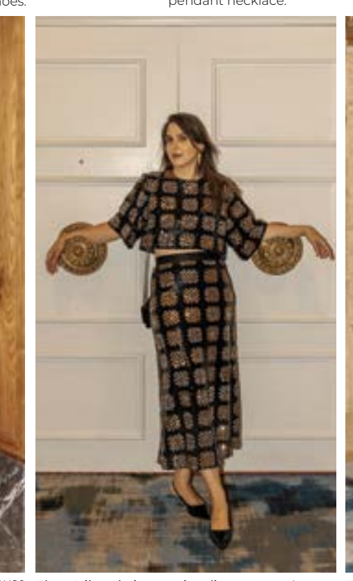
tage earrings and ring, Biko rings, Aldo shoes. and earrings.