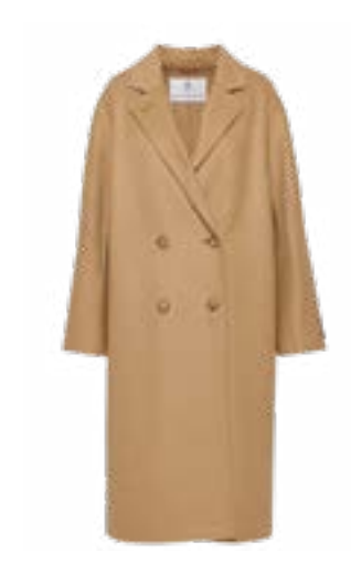
Made with 100-per-cent recycled wool, this coat is luxuriously soft inside and out—they'll be reaching for it all season long.