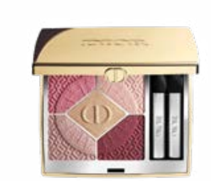
For occasions that call for a touch of sparkle, this limitededition palette features five eyeshadows—gold, glittery peach, pink and matte burgundy—in a luxurious gold case DIOR DIORSHOW 5 COULEURS IN GOLDEN MASQUERADE, $92, DIOR.COM