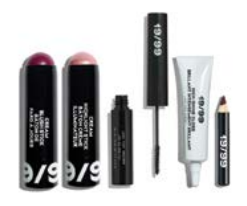
This set from Toronto's 19/99 will elevate their beauty game. With a cream blush stick, highlighter, pencil and mascara, it's perfect for everyday, evening and everything in between. 19/99 BEAUTY FLUSH AND GLOW KIT, $51, 1999BEAUTY.COM