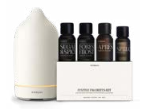
Vitruvi's beloved Stone Diffuser and seasonal essential oils—Sugar & Spice, Forest Frost, Après and Spruce—will create a warm, inviting atmosphere in any home. VITRUVI DIFFUSER HOLIDAY BUNDLE, $197, VITRUVI.CA