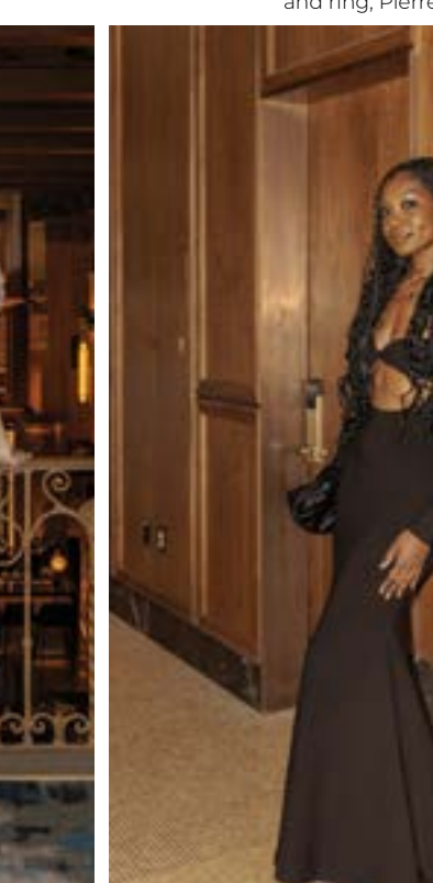
of Gallagher dress, Biko necklace and earrings, Smythe top and skirt. @NoahNoahNoah vin-Mademoiselle Jules ring.