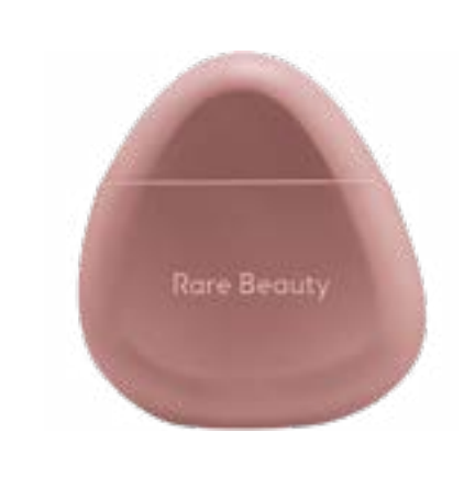
Cold weather and chapped skin unfortunately go handin-hand. Made with niacinamide to support the moisture barrier, this cream will keep your hands smooth. RARE BEAUTY FIND COMFORT NIACINAMIDE HYDRATING HAND CREAM, $25, SEPHORA.CA