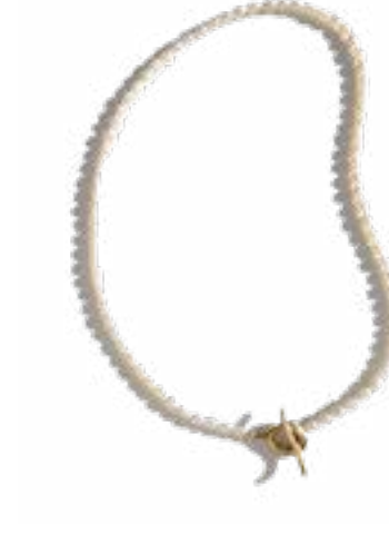
This freshwater pearl necklace is a unique update on a classic—the sculptural toggle can be worn at the front as a pendant or at the back, so the pearls are the focus. CADETTE NECKLACE, $295, CADETTEJEWELRY,COM