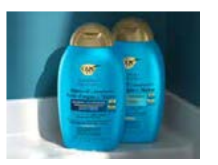
ARGAN OIL OF MOROCCO: REPAIRS VISIBLE DAMAGE IN ONE USE AND LEAVES HAIR STRONG WITH A CITRUS-FRESH, WOODY SCENT.

personal forms of self-exit healthy is key to showcasing your authentic self. OGX® makes it easier than ever with its newly refreshed collection of shampoos and conditioners. These updated formulas address a variety of hair care needs, making them the perfect holiday gift — or a treat-yourself moment for winter hair care.