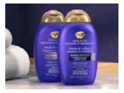
BIOTIN & COLLAGEN: BOOSTS VOLUME FOR 72 HOURS AND STRENGTHENS STRANDS WITH A JASMINE-VANILLA AROMA.