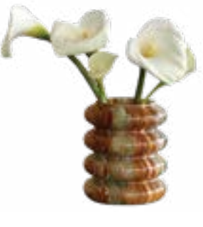
Made from hand-carved and polished green onyx marble, this stunning multi-purpose vessel \, can be used as a vase or to store utensils and is big enough to chill a bottle of wine. SHOPPE CLOVER VASE, $225,

This content was created by The Kit; Coty funded and approved it.