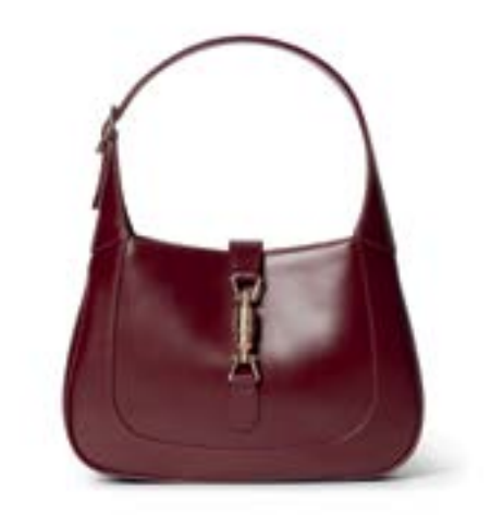
The search for the perfect handbag stops here. With its crescent shape and on-trend dark cherry finish, the Jackie \, 1961 shoulder bag can take you from work to a soirée.