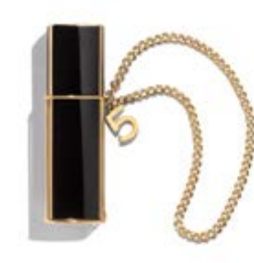
Take Chanel's most iconic fragrance with you anywhere, slipped in a clutch or worn on the wrist via a dainty chain adorned with Gabrielle Chanel's lucky number 5.CHANEL NO.5 EAU DE PARFUM PURSE SPRAY, $264, CHANEL.COM