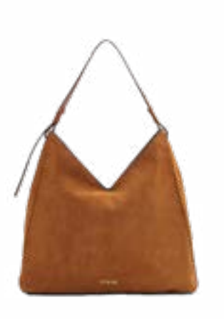
With its sophisticated V-cut detail, this suede shoulder bag fits comfortably under the arm and offers easy access to essentials, from lip gloss to an iPad. STAUD BAG, $600, SIMONS.CA