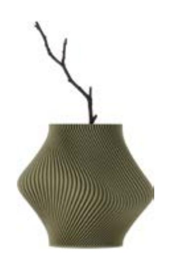
This sculptural 3-D-printed vase can shine on its own or hold a fresh bouquet of favourite blooms. The olive hue adds a sohpisticated pop of colour to any minimalist room. SHEYN VASE, $90, SSENSE.CA

With the holidays on the horizon, we're here to take the guesswork out of gifting with joy-giving ideas they'll love