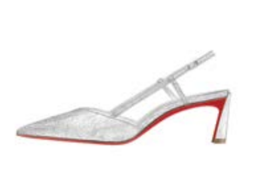
Silver sling-back heels with seasonally-appropriate red soles will take any holiday look to shimmery new heights. What could be more dance-floor-ready? CHRISTIAN LOUBOUTIN SHOES, $1,445,