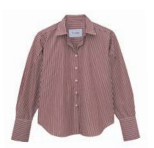
With its effortless oversized fit, curved sleeves and striking merlot stripes, Canadian brand T.Line's Isabel shirt is destined to become a wardrobe favourite. T.LINE SHIRT, $295, SHOPTLINE.COM