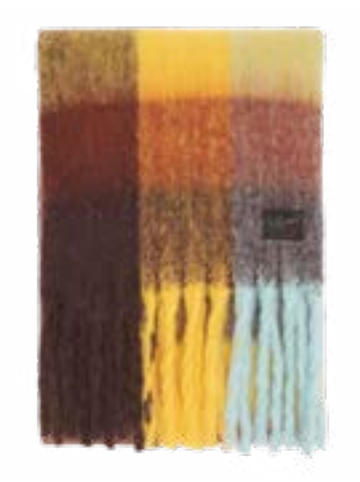
Add a pop of unexpected colour to their monochromatic winter wardrobe with this checkered scarf in earthy and pastel tones. Made from a cozy wool blend, it's the ultimate cold-weather companion ROOTS SCARF, $68, ROOTS.COM