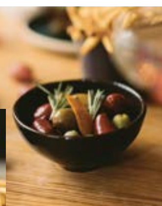
Marinated olives with rosemary.