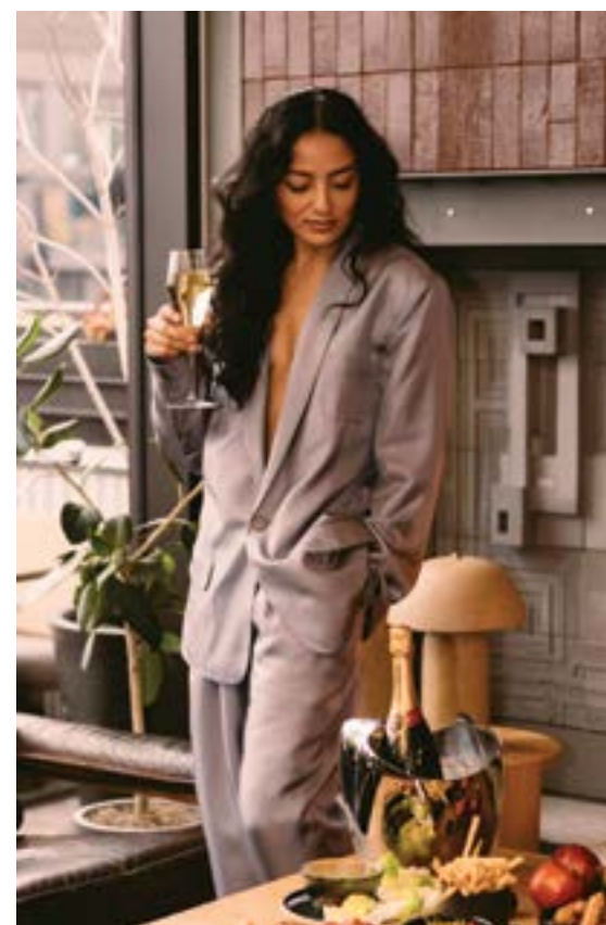
Selene is wearing SILK LAUNDRY BLAZER, $620, PANTS, $550, SILK LAUNDRY.CA; CAROLE TANENBAUM VINTAGE COLLECTION EARRINGS, PRICE UPON REQUEST, CAROLETANENBAUM.COM; JENNY BIRD RINGS, $158 EACH, JENNY-BIRD.CA.