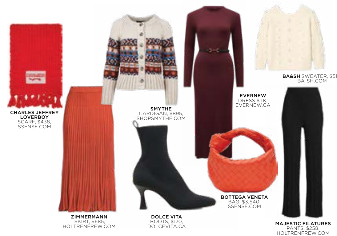
CHARLES JEFFREY LOVERBOY SCARF , $438, SSENSE.COM

Start with a versatile cardigan. Wear it buttoned up as a top, undone over a camisole or reversed for a chic twist with the buttons at the back. A knit dress or skirt will be cozy yet polished—opt for a chic maxi length and pair with kitten heels or sleek boots. For a festive touch that feels relaxed, choose knits with special details, like a gem-embellished sweater with a knotted back.