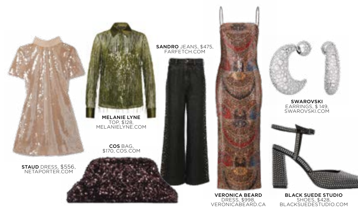
STAUD DRESS , $556, NETAPORTER.COM

The goal is to make your wardrobe work as hard as your calendar, with looks that effortlessly flow from intimate dinners to fizzy parties, while still feeling special and unique to you. This season's trends—a fresh take on shimmer, cozy yet elevated knits and textures with depth and dimension—will get you there. It's about striking the balance between festive and functional, with items that don't just shine once but become part of your story for seasons to come.