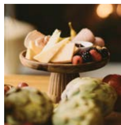
APPS AT THE ACE Charcuterie board with chef's selection of cheeses, cured meats and grissini.

STOCK NON-ALCOHOLIC OPTIONS “Don't forget about your friends who don't drink! Just because someone doesn't drink alcohol doesn't mean they should only have soda or a syrupy mocktail. There are so many great options out there as far as non-alcoholic spirits go, so do some research and talk to your local bartender and see what they're using.”