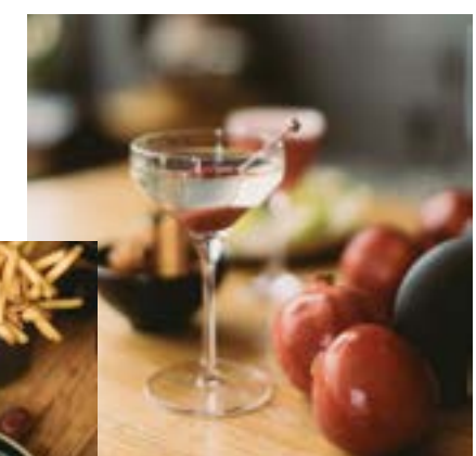
The Ace Martini, with London dry gin, vermouth blend and Ace tincture.