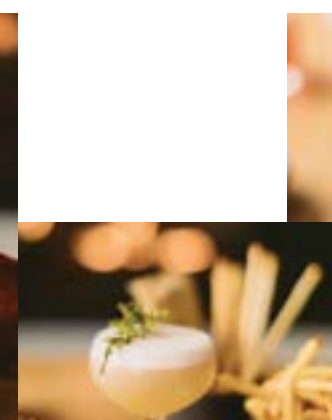
A Cicada Days cocktail, with gin, cedar syrup, grapefruit, lemon and cypress bitters.