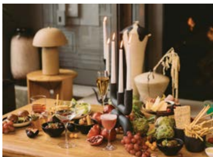
MARARAMIRO LAMP $2,750, VESSEL (LARGE), $1,088, VESSEL, $620, CANDLEHOLDER, $175, MARARAMIRO.COM