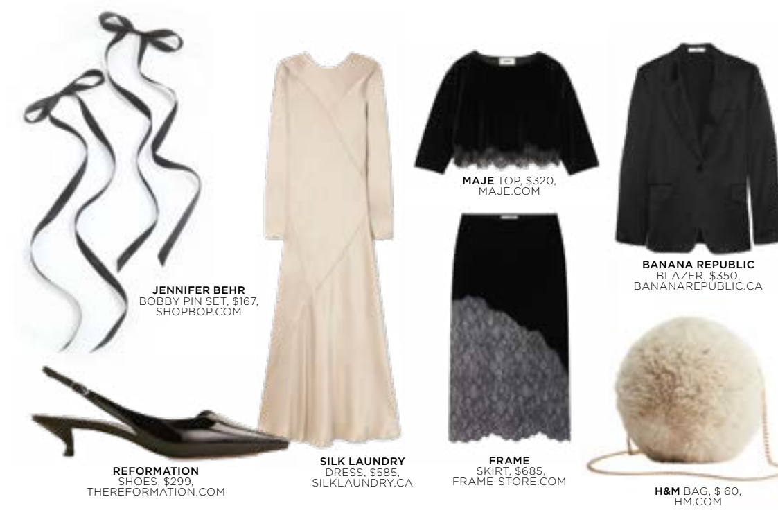
JENNIFER BEHR BOBBY PIN SET , $167, SHOPBOP.COM