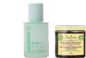
DESIGN ME GLOSS ME HAIR SERUM, $32, DESIGNMEHAIR.CA. SHEA MOISTURE JAMAICAN BLACK CASTOR OIL STRONG HOLD STYLING GEL, $15, WALMART.CA

TEXTURE PLAY Kerry Washington's swept-back curls highlight how contrasting textures can lead to ultra-elegant results. Nailing a clean, straight middle part is step 1. "For runway shows, the parting is a small detail that makes any hairstyle look elevated," says Guille. Then, apply a strong hold gel in even layers throughout the hair on top of the head for control, leaving the ends loose, before slicking back hair with your hands and gathering it into a low ponytail. Next, perfect the pouf, fluffing out the ends. "Seeing her natural texture at the front is part of what makes this so beautiful," says Guille. Use a thin curling wand to define any loose curls and finish with a touch of hair oil for extra shine. "Curly hair needs moisturizing more than any other hair type," she says. "Put a bit of oil into the palm of your hand and use your fingers to re-twist pieces."