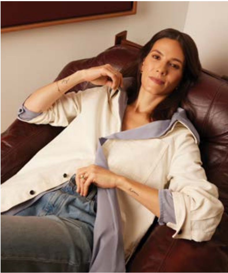
BOTTEGA VENETA SHIRT, $2,540, HOLTRENFREW.COM. THE ROW JEANS, $1,030, SSENSE.COM. BEAUFILLE EARRINGS, $260, RING, $635, BEAUFILLE.COM