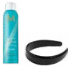
MOROCCANOIL DRY TEXTURE SPRAY, $36, CA.MOROCCANOIL.COM. H&M HAIRBAND, $12, WWW2.HM.COM

MODERN BOUFFANT For a glam yet modern moment, consider Nicola Coughlan's wispy bouffant. "It's not too coiffed; it looks like your hair when you've just woken up," says Guille. "It all comes down to volume and bend and how much back-combing you do." Apply a heat protectant and blow-dry to create lift at the roots. Then using a 1-in. curling wand all over, "curl pieces in alternating directions to give more body." Using your ears as a guideline, separate the front section on both sides and clip them, then back-comb small sections from the crown to the mid-back of the head, leaving a layer of un-teased hair in front. Brush this top layer of hair over the teased crown and pin it in place. Apply texture spray to the loose front and back sections. Pin the ends of the front sections to the back of your head for a half-up effect, twisting the ends slightly before pinning for more grip. Finally, slip on a headband before gently pulling out face-framing strands.