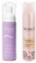
FUNCTION OF BEAUTY WAVY HAIR ZERO GRAVITY STYLING MOUSSE, $21, SHOP-SHOP-PERSDRUGMART.CA. NEXXUS MAXIMUM FINISHING MIST, $20, SHOP-SHOP-PERSDRUGMART.CA