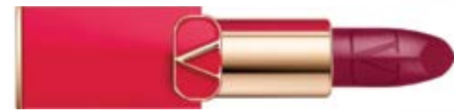
VALENTINO ROSSO VALENTINO LIPSTICK IN AMETHYST ADVENTURER, $52, VALENTINO-BEAUTY.CA