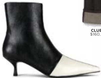
JEFFREY CAMPBELL BOOTS, $326, REVOLVE.COM