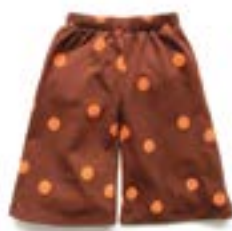
"Gender-neutral kids clothing tends to be a sea of beige, but everything in this line is cheerful and bold. I'd like to get these culottes for my son, which my daughter can wear after him."

HEIRLOOM HATS LES MADELEINES BERET, $420, HEIRLOOMHATS.COM