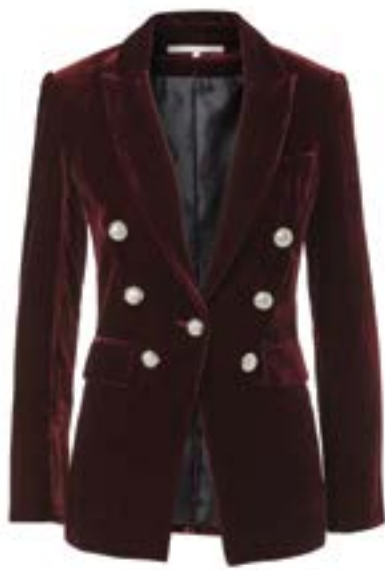
VERONICA BEARD BLAZER, $780, VERONICABEARD.COM

STYLING TIPS When putting together a look using classic pieces like a blazer, turtleneck and denim, add a statement boot to infuse the outfit with colour, pattern or texture.