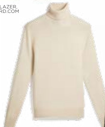
HUDSON NORTH TURTLENECK, $150, THEBAY.COM

Protect your makeup and your cream cashmere by placing a silk scarf over your head as you slip on your turtleneck.