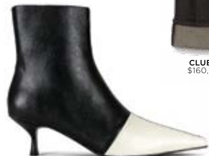
JEFFREY CAMPBELL BOOTS, $326, REVOLVE.COM