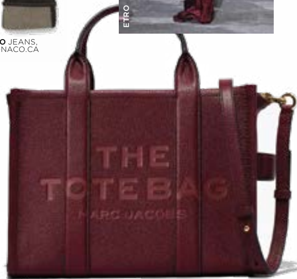
MARC JACOBS BAG, $595, MARCJACOBS.COM