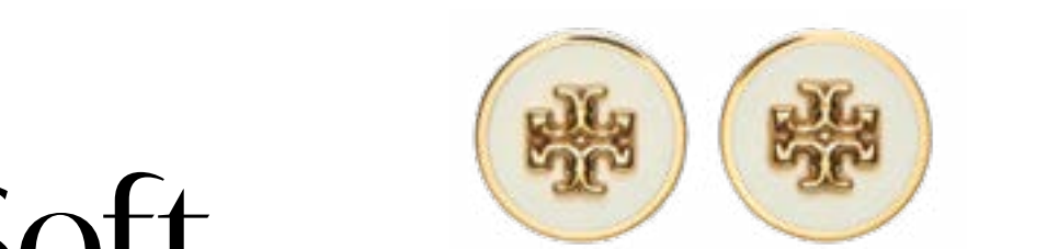
TORY BURCH EARRINGS, $98, TORYBURCH.COM