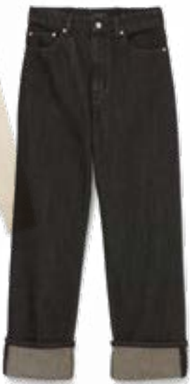
CLUB MONACO JEANS, $160, CLUBMONACO.CA