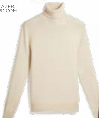
HUDSON NORTH TURTLENECK, $150, THEBAY.COM

Protect your makeup and your cream cashmere by placing a silk scarf over your head as you slip on your turtleneck.