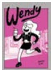
"The Wendy series is a genius satire of the art world. If you know anyone studying art or working in that field, it's a must-have. I've been given it a few times and read it when I need a chuckle."

PROMISE ME EVERYTHING CULOTTES, $57, PROMISE-ME-EVERYTHING.COM