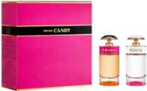
PRADA CANDY DUO, $30, PHARMAPRIX.CA

"A few of the hottest gifts this holiday season embrace luxury and elegance, making fragrance a perfect gifting option," says Qadrian. It doesn't get much more luxe than this gift set containing two versions of Prada's iconic Candy fragrance, a sophisticated, grown-up take on a gourmand scent.