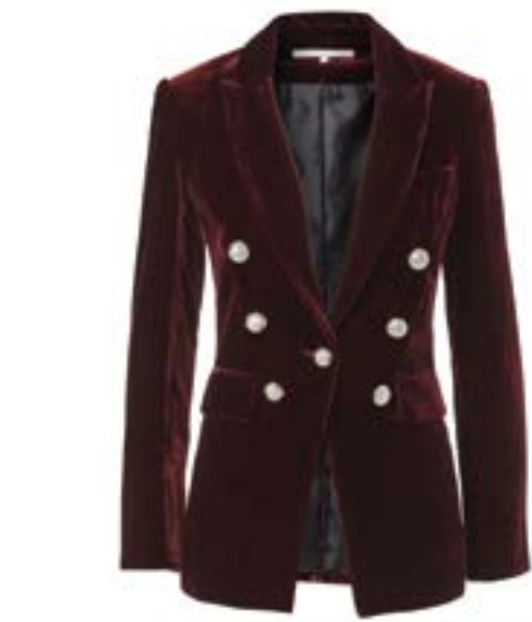
VERONICA BEARD BLAZER, $780, VERONICABEARD.COM

STYLING TIPS When putting together a look using classic pieces like a blazer, turtleneck and denim, add a statement boot to infuse the outfit with colour, pattern or texture.