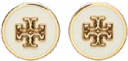
TORY BURCH EARRINGS, $98, TORYBURCH.COM

This season, wrap yourself in sumptuous, gleaming velvet, the most holiday-worthy fabric of all