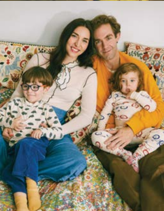
"Now that the pandemic is hopefully over, we're trying to invite people over more and entertain. It's so nice to have other families and kids over to play. It's good for us, and it's good for the kids."