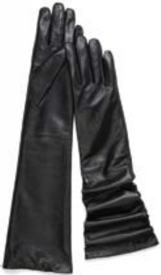
SIMONS GLOVES, $120, SIMONS.CA