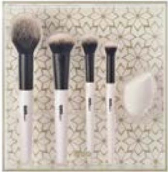
QUO BEAUTY BACK TO BASICS BRUSH SET, $45, PHARMAPRIX.CA

"My tip for shopping for young beauty enthusiasts is to consider gifting them core products to help them establish their beauty routine," says Qadrian. "This brush set is a perfect option because it has all of the tools to help them master a flawless complexion, whether they're looking for a non-makeup makeup look or full-on glam."