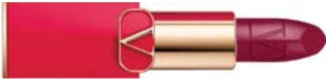
VALENTINO ROSSO VALENTINO LIPSTICK IN AMETHYST ADVENTURER, $52, VALENTINO-BEAUTY.CA