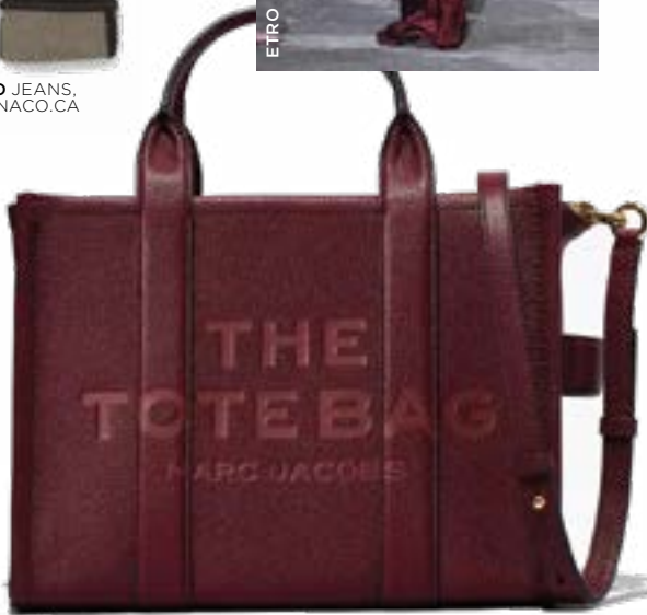
MARC JACOBS BAG, $595, MARCJACOBS.COM