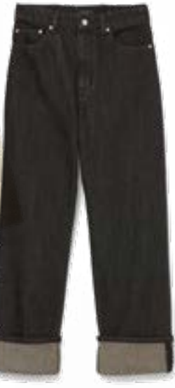
CLUB MONACO JEANS, $160, CLUBMONACO.CA