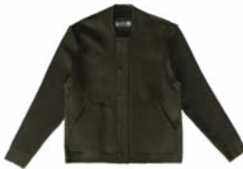
THE LAYERING HERO With temperamental spring weather, keeping lightweight outerwear within arm's reach is smart. This gender-neutral bomber from Montreal brand &Or Collective is made of ethically sourced merino wool and has zip-off sleeves, so it can be worn as a jacket or vest—a layering dream. &OR COLLECTIVE JACKET , $760, ANDORCOLLECTIVE.COM