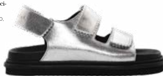
THE SILVER SANDALS A metallic sandal is the perfect statement to set off your spring uniform. Montreal-based footwear brand Maguire decided to repurpose the deadstock leather from the factories they share with other brands to construct the Extra collection, including these chunky sandals featuring scalloped-edge straps. MAGUIRE SHOES , $245, MAGUIRESHOES.COM