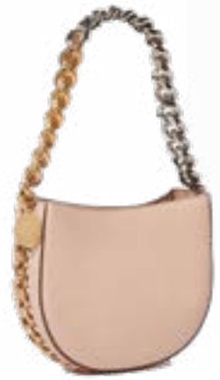
THE ROUND SHOULDER BAG A black bag is a wardrobe classic, but this one's half-moon silhouette and chunky aluminum chain give an edgier take, and it can be worn cross-body too. It's made of mycelium, the root-like structure of fungi (read: mushroom leather), a super vegan alternative to leather or vinyl. STELLA MCCARTNEY BAG, $3,445, STELLAMCCARTNEY.COM