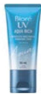
BIORÉ UV AQUA RICH WEIGHTLESS MOISTURIZER SPF 50 , $19.99, PHARMAPRIX.CA

THE FLAWLESS-FINISH BEAUTY TOOL A must-have makeup accessory, this Quo Beauty blending sponge is made with 50 per cent plant-based material—which means less plastic for the planet. "Whether you apply your foundation base with your fingers or a brush, I recommend using a makeup sponge as the next step to absorb excess product and get an air-brushed finish," says Cruz.