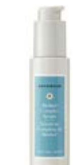
NATURIUM RETINOL COMPLEX SERUM, $33.99, SHOPPERSDRUGMART.CA