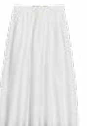
“I feel most confident when my look is a mix of tomboy and girly. I love this skirt's ability to act as a foundation for any outfit. I wear it with black chunky boots, an oversized T-shirt and black sunnies.” BANANA REPUBLIC SKIRT, $170, BANANAREPUBLIC.CA