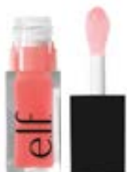
elf GLOW REVIVER LIP OIL , $10.99, PHARMAPRIX.CA