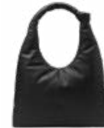
“Every girl needs a massive shoulder bag. As someone who is always going from virtual meetings to photo shoots to coffee meet-ups, I need a chic bag that can hold its shape as I carry my entire life in it.” COS BAG, $304, COS.COM