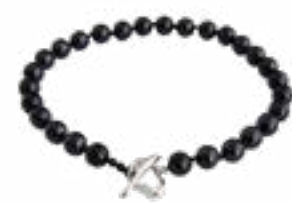
“I like the idea of wearing necklaces that catch the eye. This one is a beautiful, bold design but provides subtle shine once it's on.” VIMERIA NECKLACE, $380, VIMERIA.CO