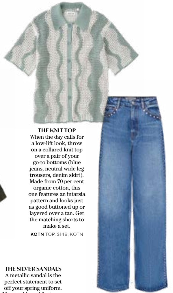
THE KNIT TOP When the day calls for a low-lift look, throw on a collared knit top over a pair of your go-to bottoms (blue jeans, neutral wide leg trousers, denim skirt). Made from 70 per cent organic cotton, this one features an intarsia pattern and looks just as good buttoned up or layered over a tan. Get the matching shorts to make a set. KOTN TOP , $148, KOTN