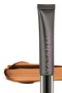
VASANTI LIQUID COVER UP FOUNDATION & CONCEALER IN 1, $27, SHOPPERSDRUGMART.CA