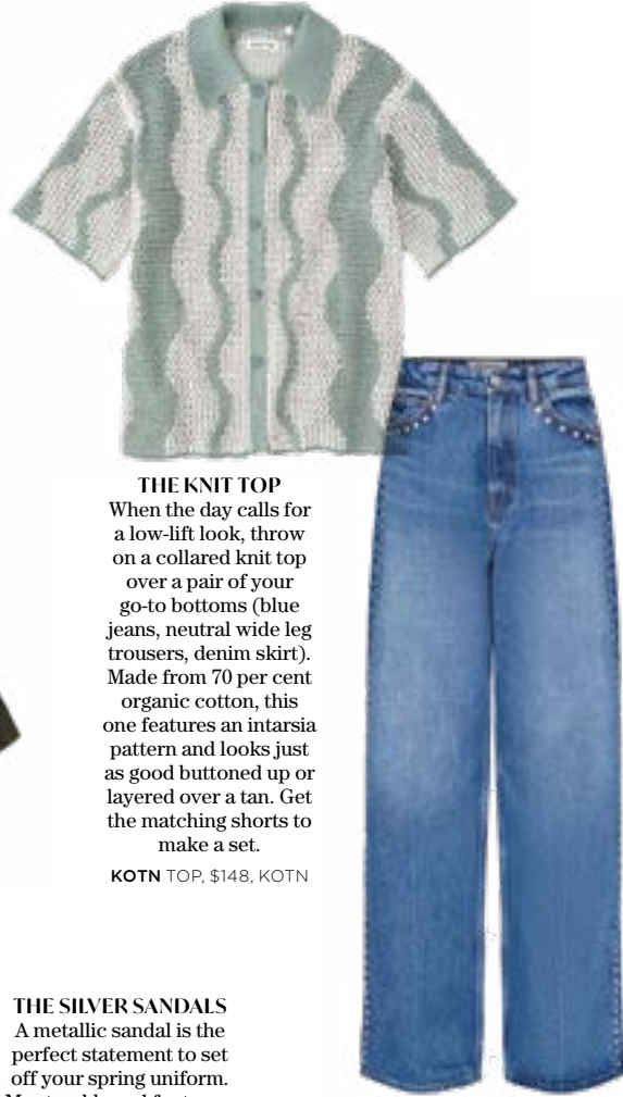
THE KNIT TOP When the day calls for a low-lift look, throw on a collared knit top over a pair of your go-to bottoms (blue jeans, neutral wide leg trousers, denim skirt). Made from 70 per cent organic cotton, this one features an intarsia pattern and looks just as good buttoned up or layered over a tan. Get the matching shorts to make a set. KOTN TOP, $148, KOTN

Spring connotes fresh starts and new beginnings, which is why we itch to ditch our dusty winter gear and shop for a whole new wardrobe when the weather warms up. While chasing the latest trends can be fun, shopping for pieces that'll end up in the back of the closet in a couple of months isn't what we're all about. These carefully chosen pieces will inject some newness to make your closet feel up to date, while being classic and high-quality enough to last for years, plus they're all made in thoughtful, eco-conscious ways. It's the best of all worlds.