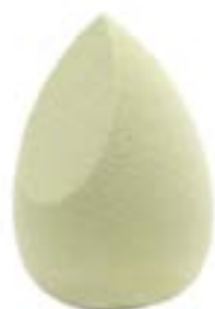
QUO BEAUTY 50% PLANT BASED BLENDING SPONGE , $10, PHARMAPRIX.CA

THE LIP LUMINIZER A lip oil is a makeup must-have this spring, and this new, nourishing and tinted formula ticks all the boxes for Cruz. "It really enhances your natural lip colour with ultra-glossy results, and I love the fresh minty scent," she says. The range of seven beautiful shades is also 100 per cent vegan, cruelty-free and Leaping Bunny certified.