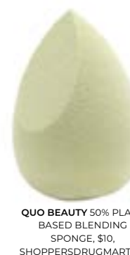
QUO BEAUTY 50% PLANT BASED BLENDING SPONGE, $10, SHOPPERSDRUGMART.CA

THE LIP LUMINIZER A lip oil is a makeup must-have this spring, and this new, nourishing and tinted formula ticks all the boxes for Cruz. “It really enhances your natural lip colour with ultra-glossy results, and I love the fresh minty scent,” she says. The range of seven beautiful shades is also 100 per cent vegan, cruelty-free and Leaping Bunny certified.