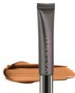
VASANTI LIQUID COVER UP FOUNDATION & CONCEALER IN 1 , $27, PHARMAPRIX.CA