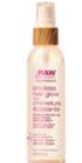
RAW SUGAR ENDLESS HAIR GLOW PERFECTING DRY OIL, $18.49, SHOPPERSDRUGMART.CA

THE ALL-IN-ONE PERFECTOR For complexion perfection, look no further than Vasanti's versatile, oil-free liquid foundation and concealer combo. “I love a good multitasking beauty product. This is a great way to simplify your routine and a must for your travel kit. Use it to conceal, blur, brighten and get lightweight coverage that blends into your skin,” says Cruz. Available in 11 shades, it also provides a touch of radiance.