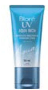
BIORÉ UV AQUA RICH WEIGHTLESS MOISTURIZER SPF 50, $19.99, SHOPPERSDRUGMART.CA

THE FLAWLESS-FINISH BEAUTY TOOL A must-have makeup accessory, this Quo Beauty blending sponge is made with 50 per cent plant-based material—which means less plastic for the planet. “Whether you apply your foundation base with your fingers or a brush, I recommend using a makeup sponge as the next step to absorb excess product and get an air-brushed finish,” says Cruz.