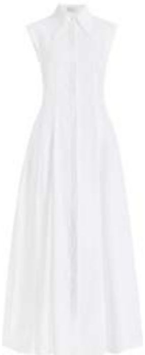
THE WHITE DRESS A linen shirt-dress is one of those pieces you'll reach for time after time. Made in a textile factory that joined the Greenpeace Detox Project, which is committed to eliminating substances harmful to the environment and human health, this one has traditional dress-shirt finishing but looks effortless. GABRIELA HEARST DRESS , $3,396, GABRIELAHEARST.COM

Spring connotes fresh starts and new beginnings, which is why we itch to ditch our dusty winter gear and shop for a whole new wardrobe when the weather warms up. While chasing the latest trends can be fun, shopping for pieces that'll end up in the back of the closet in a couple of months isn't what we're all about. These carefully chosen pieces will inject some newness to make your closet feel up to date, while being classic and high-quality enough to last for years, plus they're all made in thoughtful, eco-conscious ways. It's the best of all worlds.