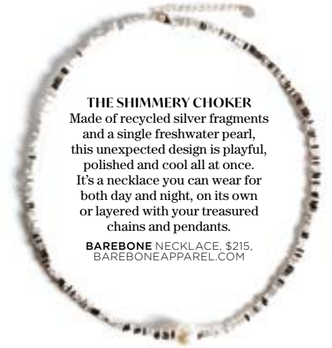
THE SHIMMERY CHOKER Made of recycled silver fragments and a single freshwater pearl, this unexpected design is playful, polished and cool all at once. It's a necklace you can wear for both day and night, on its own or layered with your treasured chains and pendants. BAREBONE NECKLACE , $215, BAREBONEAPPAREL.COM