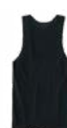
“This top is a year-round essential for me. From under an oversized blazer to topping off a skirt to throwing it on with jeans, this tank gets it done.” KOTN TOP, $58, KOTN.COM