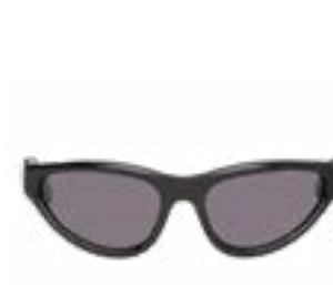
“These are the perfect everyday sunglasses. Most of my looks are simple and casual, so these sporty-looking sunglasses are the perfect grab-and-go for a daytime look.” MARNI SUNGLASSES, $415, SSENSE.COM

“I firmly believe that the way you dress plays a direct role in the way you walk, talk, and present yourself. It always primes me to be the most confident version of myself.”