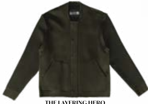
THE LAYERING HERO With temperamental spring weather, keeping lightweight outerwear within arm's reach is smart. This gender-neutral bomber from Montreal brand &Or Collective is made of ethically sourced merino wool and has zip-off sleeves, so it can be worn as a jacket or vest—a layering dream. &OR COLLECTIVE JACKET, $760, ANDORCOLLECTIVE.COM