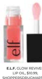
ELF GLOW REVIVER LIP OIL, $10.99, SHOPPERSDRUGMART.CA