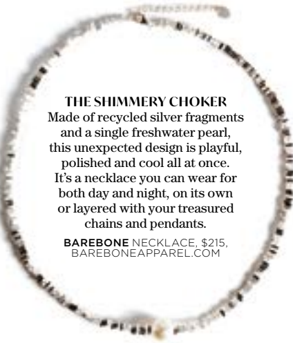
THE SHIMMERY CHOKER Made of recycled silver fragments and a single freshwater pearl, this unexpected design is playful, polished and cool all at once. It's a necklace you can wear for both day and night, on its own or layered with your treasured chains and pendants. BAREBONE NECKLACE, $215, BAREBONEAPPAREL.COM