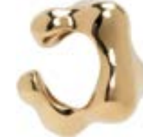
“This is my first Paris piece and I receive so many compliments whenever I wear these earrings. They immediately add dimension to your outfit, no matter what you're wearing.” PARIS EAR CUFF, $280 (SINGLE), SSENSE.COM