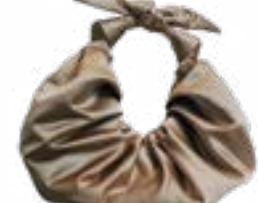
“Are you a Vancouver fashionista if you don't have a bag from ABA? This bag is so sleek and fun, adding interest to your outfit.” A BRONZE AGE BAG, $190, ABRONZEAGE.COM