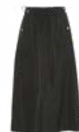
“This is a cool and casual piece that can be easily dressed up depending on your surrounding accents. This one is a great example of my style, where it shows off the waist but is still a little baggy.” INWEAR SKIRT, $139, SIISTA.COM