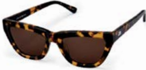
THE CAT-EYE SUNGLASSES Top off your spring outfits with modern yet timeless cat-eye sunglasses. The D-frame style by Canadian jeweller Jenny Bird is handmade out of biodegradable acetate, and they're light. Read: easy to wear all day long. JENNY BIRD SUNGLASSES, $240, JENNYBIRD.CA