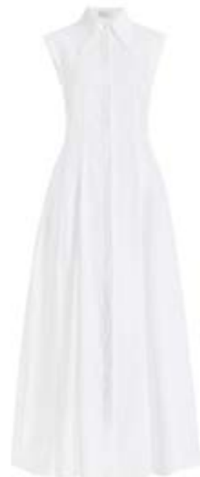
THE WHITE DRESS A linen shirt-dress is one of those pieces you'll reach for time after time. Made in a textile factory that joined the Greenpeace Detox Project, which is committed to eliminating substances harmful to the environment and human health, this one has traditional dress-shirt finishing but looks effortless. GABRIELA HEARST DRESS, $3,396, GABRIELAHEARST.COM