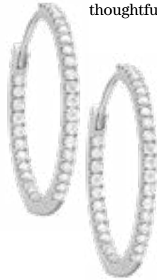
THE HOOP EARRINGS Hoop earrings make even the most casual outfits glamorous, especially when pavé diamonds are involved. In this pair, diamonds are set both outside and inside the hoop for extra sparkle. They're made of lab-grown diamonds and recycled 14K gold by Proud Diamond, a Montreal-founded jewellery brand specializing in conscientious sourcing. PROUD EARRINGS , $3,800, PROUDDIAMOND.COM