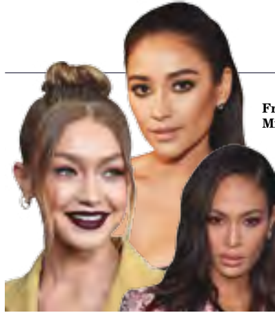
From left: Gigi Hadid, Shay Mitchell, Joan Smalls.