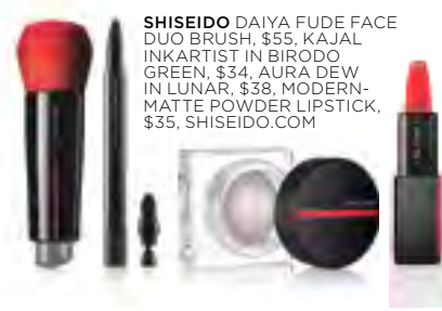
SHISEIDO DAIYA FUDE FACE DUO BRUSH, $55. KAJAL INKARTIST IN BIRODO GREEN, $34. AURA DEW IN LUNAR, $35. MODERN MATTE POWDER LIPSTICK, $35. SHISEIDO.COM

What's your favourite product from this collection? “There's this Aura Dew highlighter that comes in three shades and is so stunning. It's very translucent, but has a lot of shine, so when you put it on the skin and the light hits it, it really gleams.”