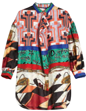
WEEKEND MAX MARA BLOUSE, $650