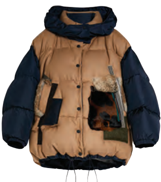
WEEKEND MAX MARA PUFFER JACKET, $1,095