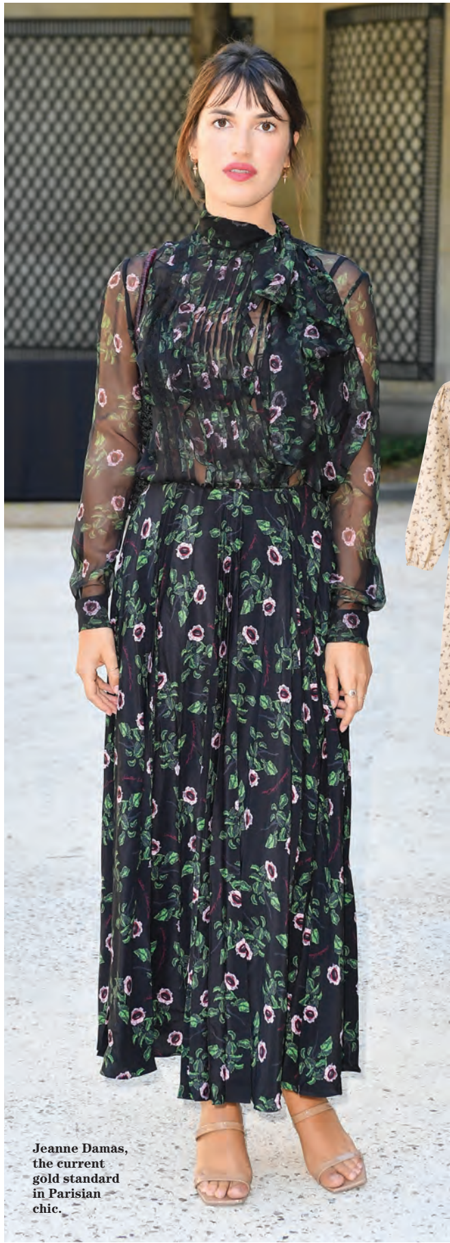
Jeanne Damas, the current gold standard in Parisian chic.