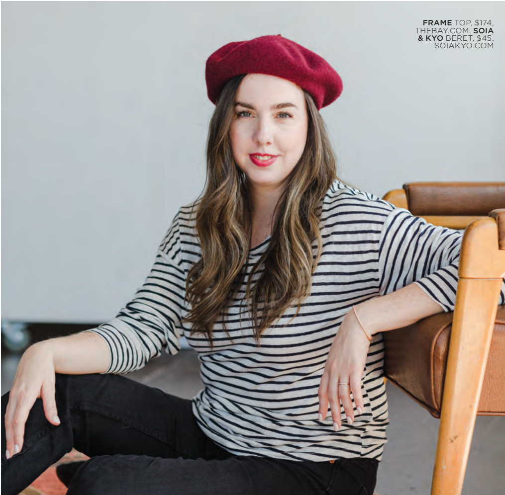
FRAME TOP, $174, THEBAY.COM, SOIA & KYO BERET, $45, SOIAKYO.COM

Around the time I'm usually arriving at the office, I stroll to my local bakery and order a full-fat latte and croissant only to be told they have none of the buttery crescents I'm craving. I pivot to a fresh blueberry scone, murmuring " C'est la vie! " and sit on the patio. I stow my phone in my bag (scrolling zombie-eyed through Instagram = so not chic) and