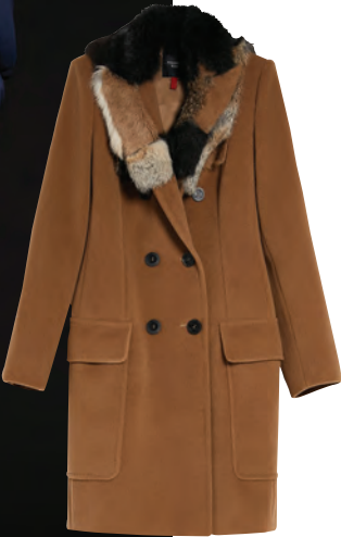
WEEKEND MAX MARA COAT, $1,780