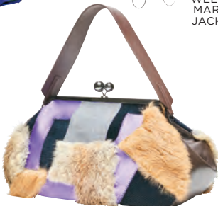
WEEKEND MAX MARA HANDBAG, $660

To celebrate the launch of the Chaotic Elegance collection in Vancouver, Weekend Max Mara stores will host a launch event at its stores on September 19.