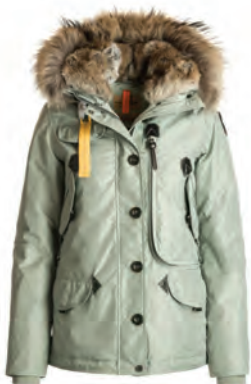
PARAJUMPERS GOBI BASE JACKET, $785, PARAJUMPERS.IT/CA

Haven't you heard? Pastel aloe green is one of the biggest colours of the season. This down jacket features an adjustable hood with removable fur and elastic at the waist for added comfort.