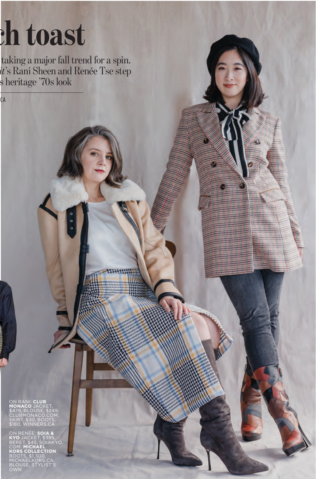
ON RANI: CLUB MONACO JACKET, $479, BLOUSE, $249, CLUBMONACO.COM. SKIRT, $30, BOOTS, $180, WINNERS.CA