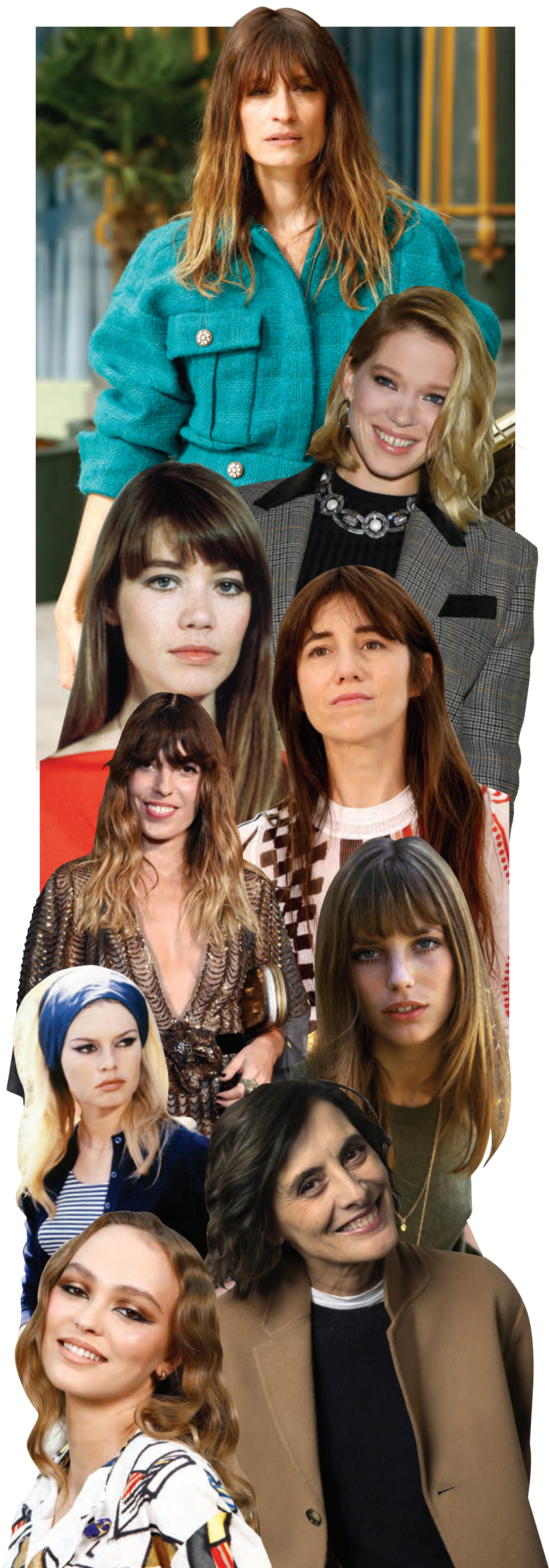
French hair muses, then and now: (clockwise from top) Caroline de Maigret, Léa Seydoux, Charlotte Gainsbourg, Jane Birkin, Inès de la Fressange, Lily-Rose Depp, Brigitte Bardot, Lou Doillon and Françoise Hardy.