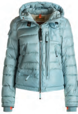
PARAJUMPERS DORIS JACKET, $1,155, PARAJUMPERS.IT/CA

This hooded, down-filled ski jacket comes in the freshest shade of aqua—like your favourite pair of light jeans. It's slim-fitting and sporty, making it perfect for chilly weekend walks.