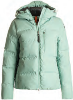
PARAJUMPERS SKIMASTER JACKET, $930, PARAJUMPERS.IT/CA

Minimalists, this one is for you. This mint topper features oversized quilting and a hidden elastic at the bottom to keep you warm. It's so sleek, you won't want to take it off when you get inside out of the cold.