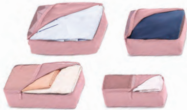
AWAY PACKING CUBES, $75 (SET OF FOUR), AWAYTRAVEL.COM