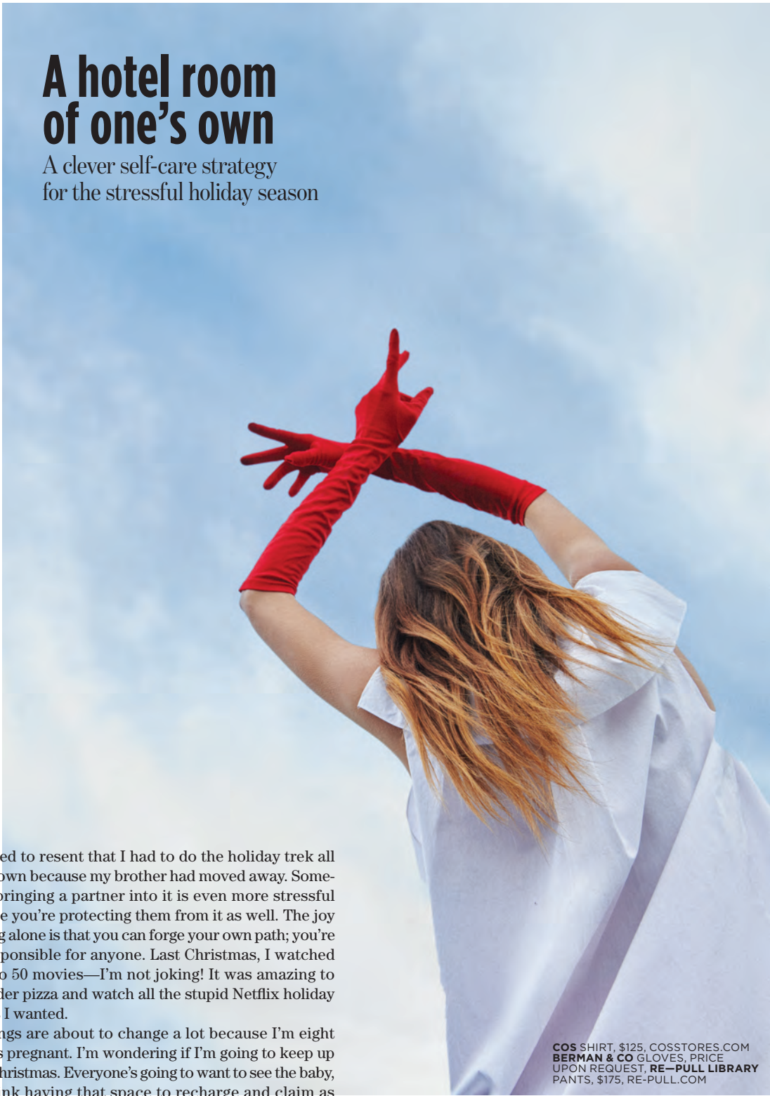
COS SHIRT, $125, COSSTORES.COM BERMAN & CO GLOVES, PRICE UPON REQUEST, RE-PULL LIBRARY PANTS, $175, RE-PULL.COM