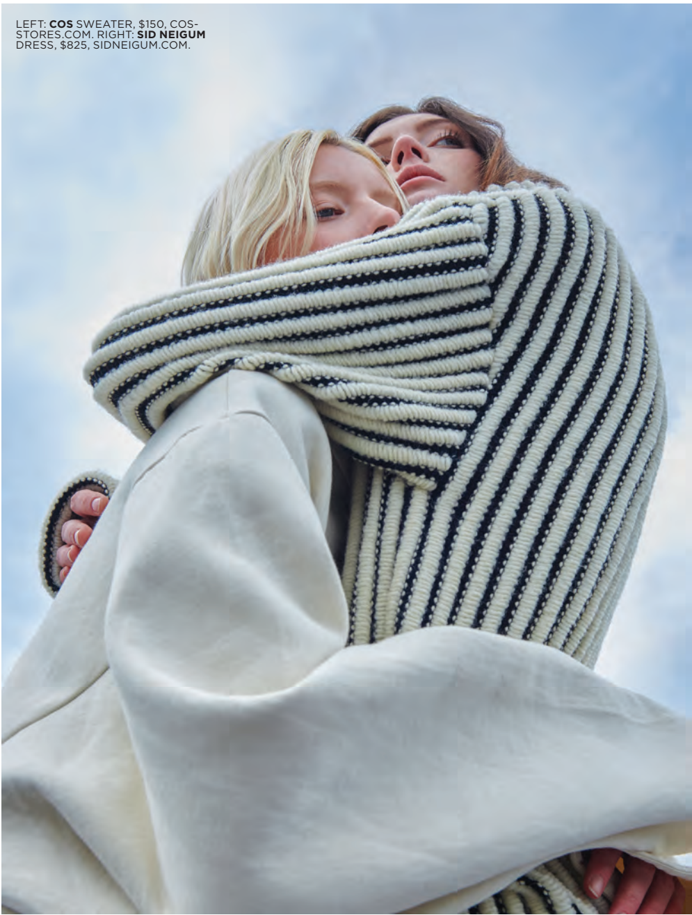
LEFT: COS SWEATER, $150, COS-STORES.COM. RIGHT: SID NEIGUM DRESS, $825, SIDNEIGUM.COM.