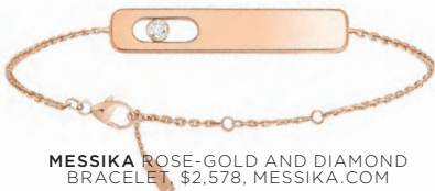
MESSIKA ROSE-GOLD AND DIAMOND BRACELET, $2,578, MESSIKA.COM

The hack: "I pre-plan everything I'll wear on a trip in front of a mirror. That way, I don't give myself the option to change my mind. I'll pack lots of black but warm it up with rose-gold jewellery."