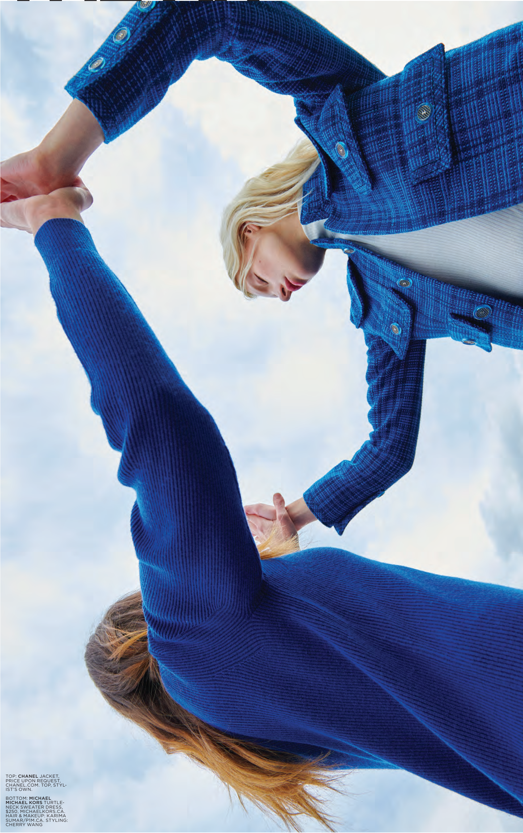
TOP: CHANEL JACKET, PRICE UPON REQUEST, CHANEL.COM. TOP, STYL-IST'S OWN.

Issue 2: Sparkly Canadian jewels, unique gifts for your best friend and wines to bring to your next party