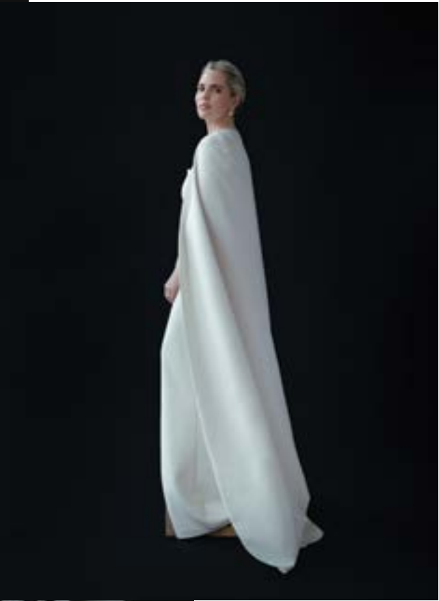
SOPHIE ET VOILA DRESS, $2,285, CAPE, $2,080, LOVERS.LAND BLAIR NADEAU EARRINGS, $75, BLAIRNADEAU.COM