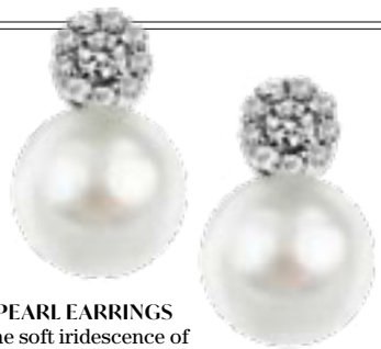
PEARL EARRINGS The soft iridescence of a perfectly rounded pearl adds instant elegance to any wedding look. PARIS JEWELLERS EARRINGS, $679. PARISJEWELLERS.COM