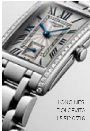
LONGINES DOLCEVITA L5.512.0.71.6

Off-screen, Lawrence is a passionate advocate for gender equality, and is on the board of Represent.us, a non-partisan organization working nationwide to pass powerful anti-corruption laws.