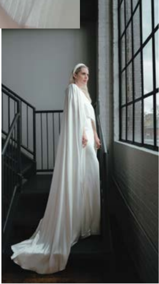
MONIQUE LHULLIER DRESS AND CAPE, PRICE UPON REQUEST, WHITE TORONTO BLAIR NADEAU HEADBAND, $350, BLAIRNADEAU.COM