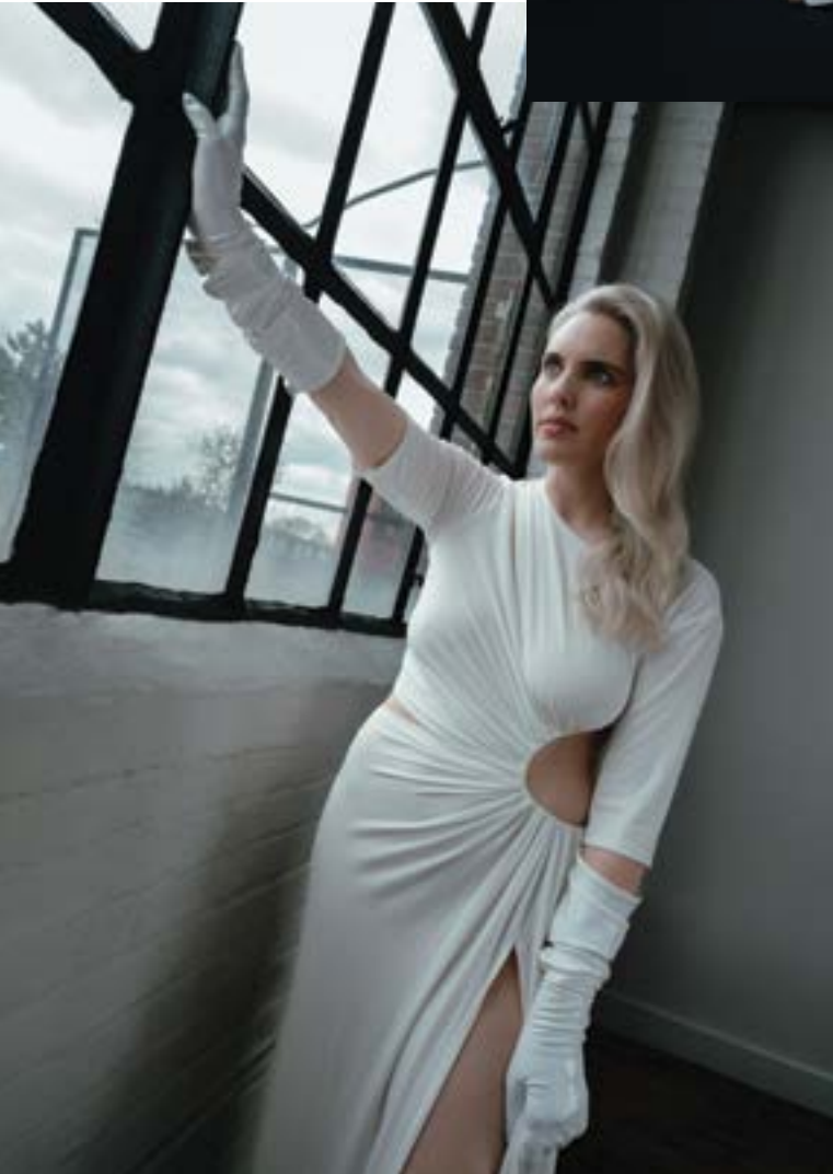
SID NEIGUM DRESS, $790, SIDNEIGUM.COM GUCCI GLOVES, $975, SSENSE.COM ON COVER: DRIES VAN NOTEN DRESS, $2,600, SSENSE.COM