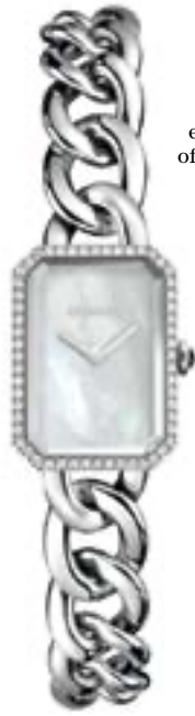
STEEL WATCH The links can symbolize eternity, while the mother-of-pearl watch face—framed by diamonds—is worthy of a forever love. CHANEL WATCH, $9,350. CHANEL.COM