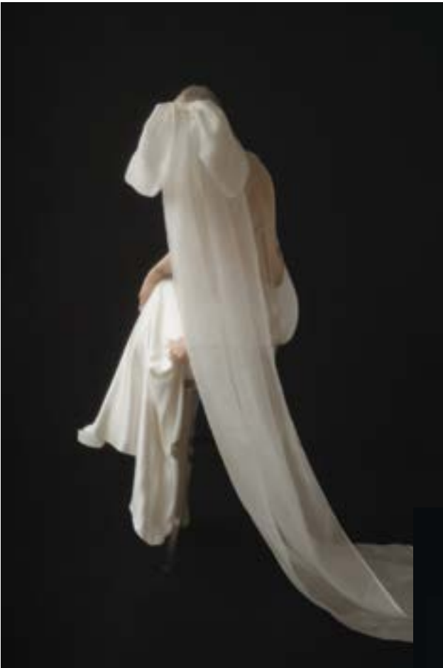
MONIQUE LHULLIER DRESS, PRICE UPON REQUEST, WHITE TORONTO JENNIFER BEHR EARRINGS, $650, WHITE TORONTO THE LOVED ONE VEIL, $350, THELOVEDONE.CA ALDO SHOES, $130, ALDOSHOOES.COM

My dress must be one I can party in and have an air of whimsy about it.