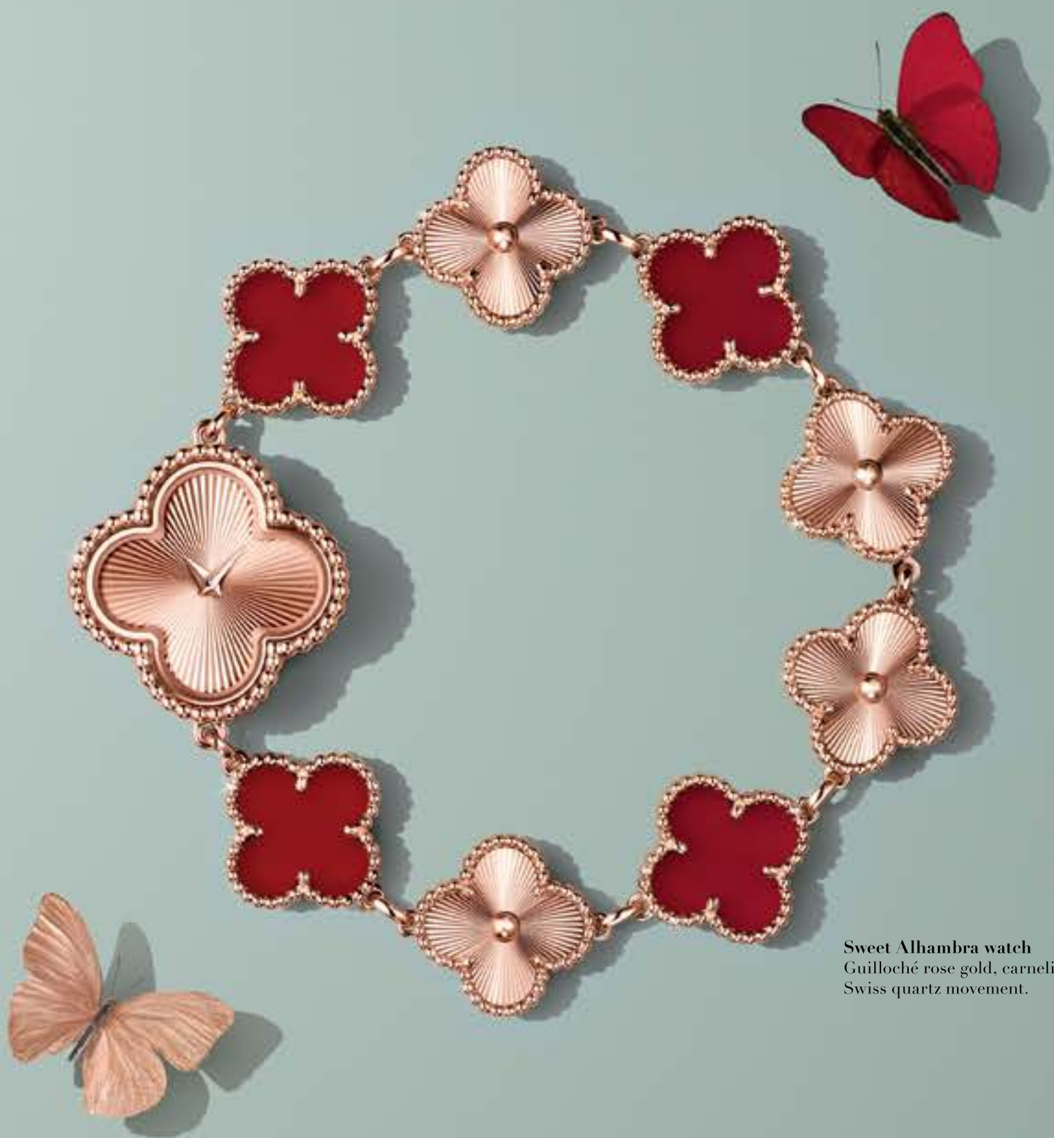
Sweet Alhambra watch Guilloché rose gold, carnelian, Swiss quartz movement.