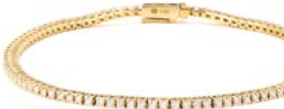
TENNIS BRACELET Once a symbol of Upper East Side-y status, the diamond line bracelet has loosened up. You'll wear this long past your big day. MEJURI BRACELET, FROM $6,000. MEJURI.COM