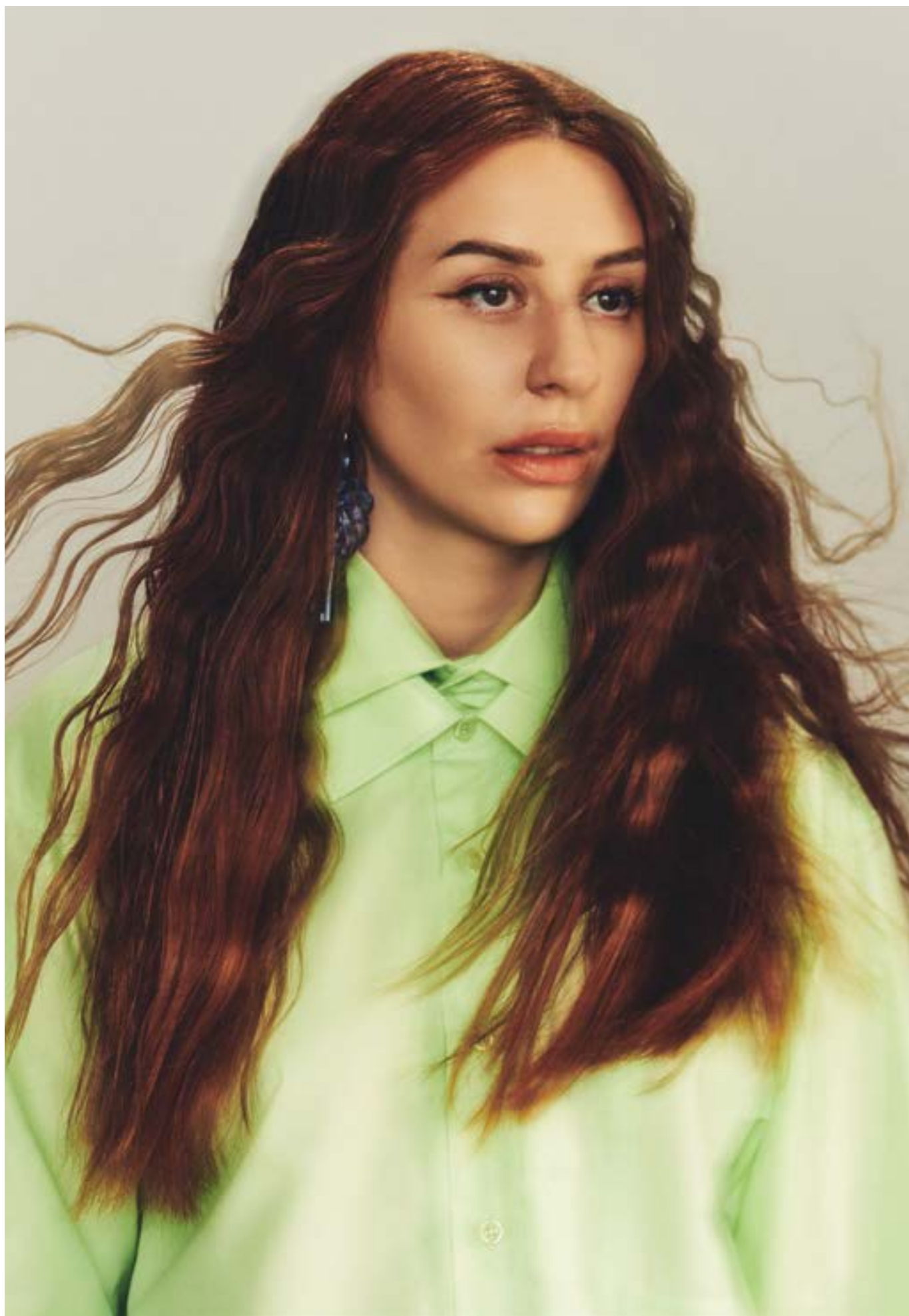
BETTER TOP, $1.075, ABSOLUTELYFABRICS.COM. COREY MORANIS EARRINGS, $185, COREYMORANIS.COM

I think that everybody was looking for human connection, and my videos feel as if you're hanging out with a friend.