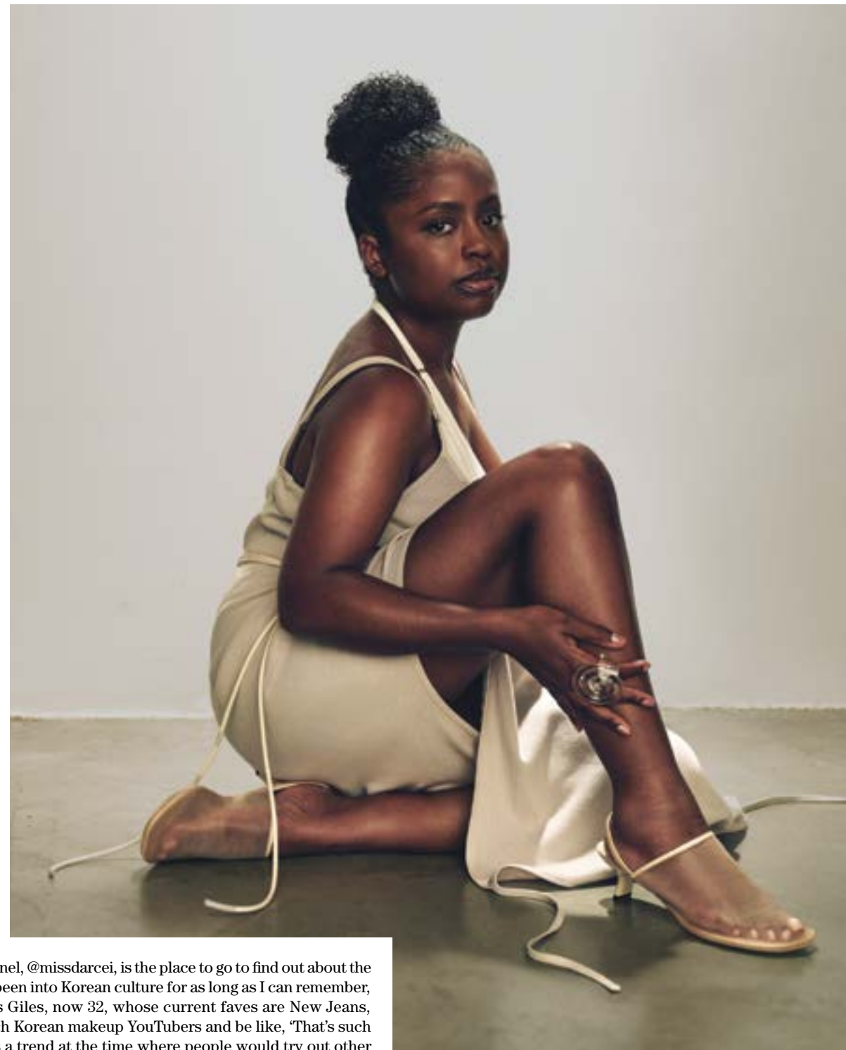
JANE/WADE DRESS, $490, ABSOLUTELYFABRICS.COM. COREY MORANIS BELT, $375, RING, $125, COREYMORANIS.COM. LOEWE SHOES, $1,250, HOLTRENFREW.COM

I tried different makeup styles that Black people don't usually participate in. I started getting a lot of messages from Black girls, like, "Oh my God, I was too afraid to try this thing."