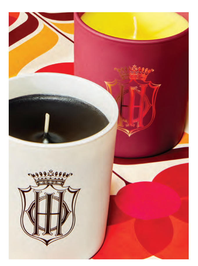
Fired up Your hostess-gift shopping list just got an upgrade PAGE 3