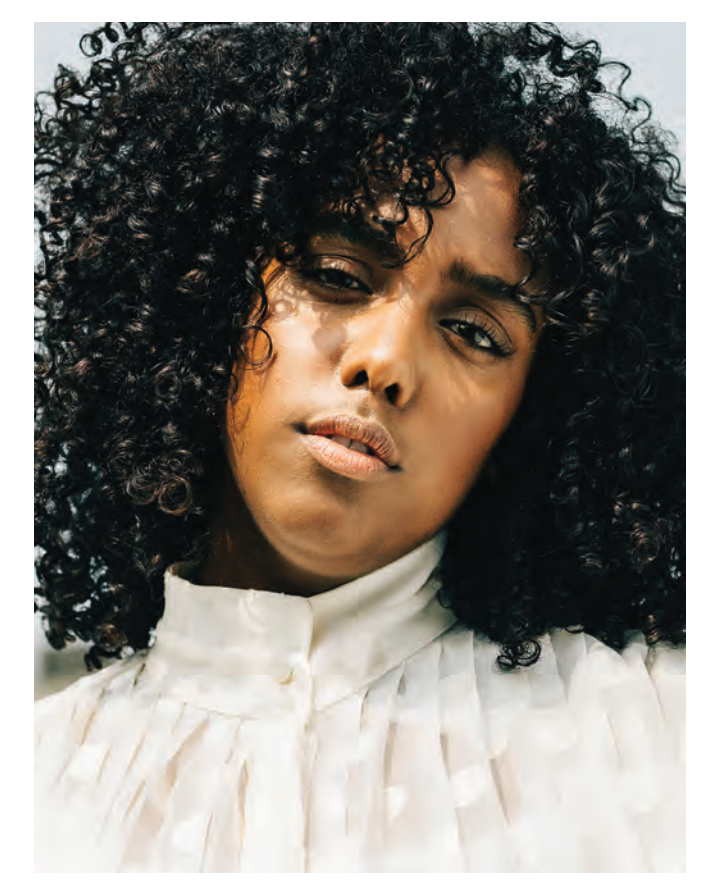
Natural beauty Four women test-drive the season's top hair trend PAGE 4