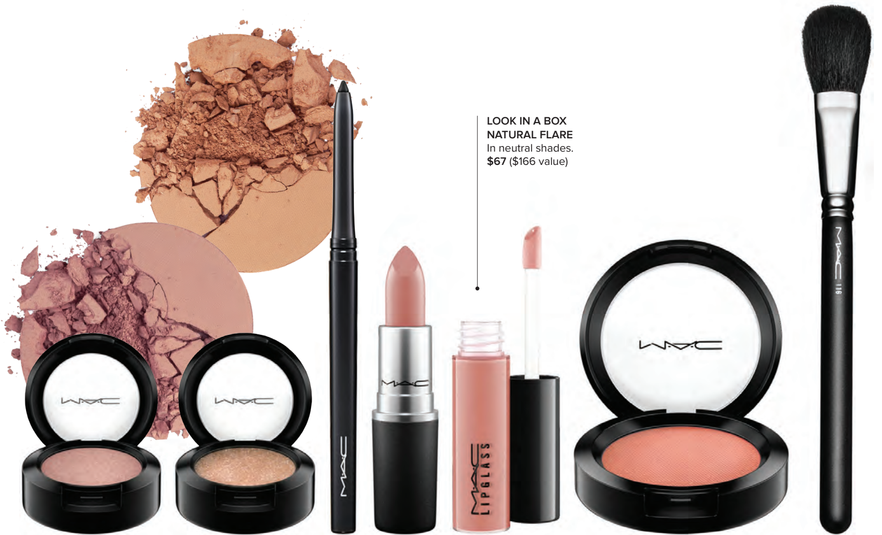
LOOK IN A BOX NATURAL FLARE In neutral shades. $67 ($166 value)