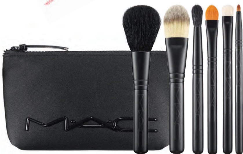
BASIC BRUSH KIT $71.50 ($207 value)