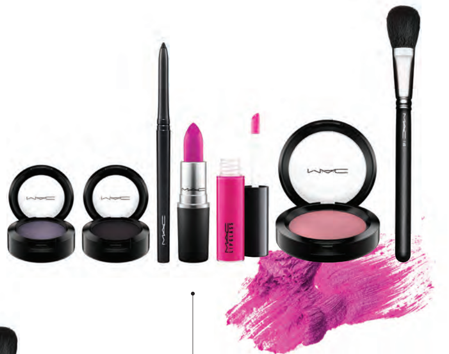
LOOK IN A BOX SULTRY DIVA In plum shades. $67 ($166 value)