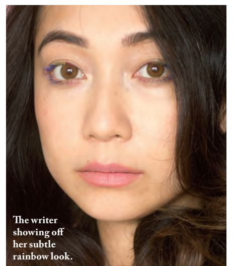
The writer showing off her subtle rainbow look.