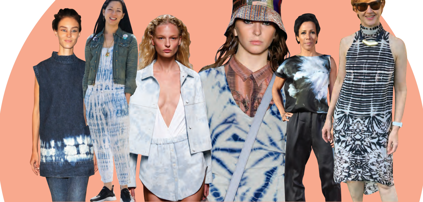
From left: Tie-dye at Rachel Comey; paired with denim for low-key street style; on the runway at Thakoon; layered at the BCBG show; having a red carpet moment with British athlete Kelly Holmes; the author in Laura Siegel.

You know a trend is having a moment when a group of Gen-Zers breaks the world record for the number of people in one location wearing it. This happened earlier this year in Calgary when 885 students at Bishop Grandin High School assembled the largest gathering of people wearing tie-dye shirts. Channeling a '60s-style love-in, the students gathered in the gym after having tied, knotted and dyed the shirts as a way to promote school spirit.