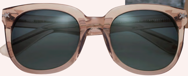
Sunny days See the world through rose-framed glasses. C4 EYEWEAR X SUSIE WALL SUNGLASSES, $125, ARITZIA.COM