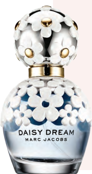
Daisy dream Fresh grapefruit, blackberry and pear notes mix with jasmine, blue wisteria and coconut water, for a light and airy summery scent. MARC JACOBS DAISY DREAM EDT, $90 (50ML), SEPHORA.CA