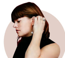
SUMMER FLING DJ "Flesh without Blood" by Grimes

Canadian DJs share their top summer tracks