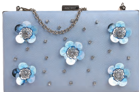
Blue belle These iridescent paillette florets are anything but garden variety. NINE WEST CLUTCH, $115, NINEWEST.CA