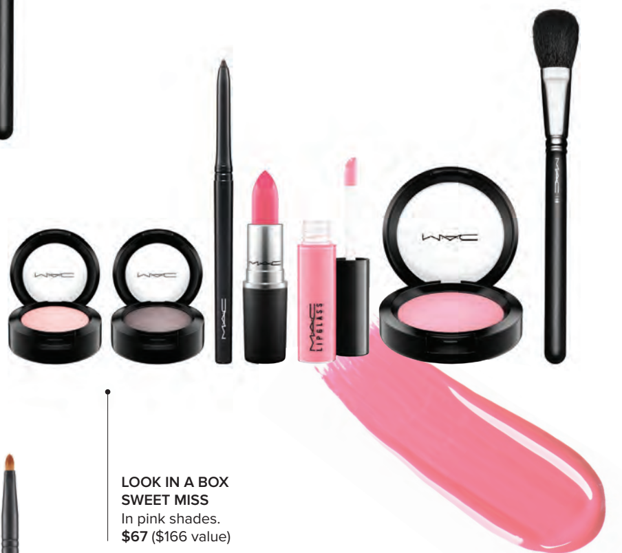
LOOK IN A BOX SWEET MISS In pink shades. $67 ($166 value)