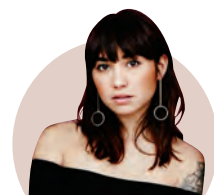
PEACH "Let's Lovedance Tonight" by Gary's Gang