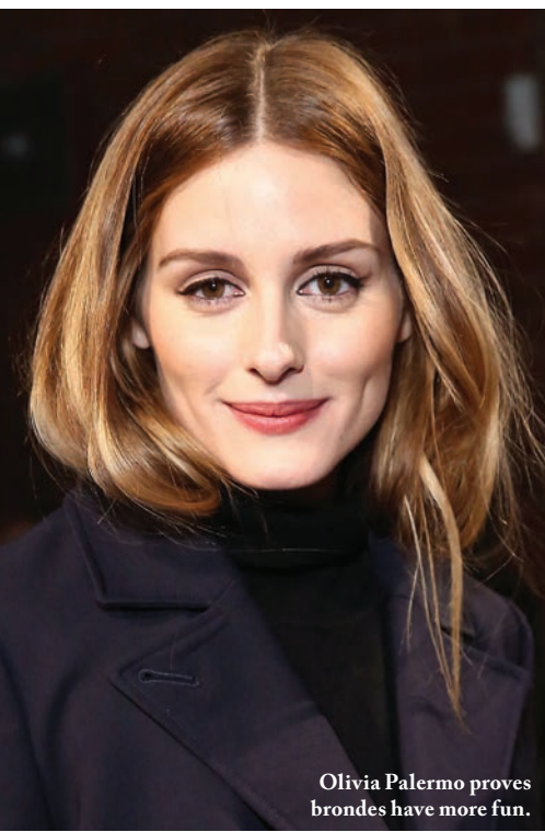
Olivia Palermo proves brondes have more fun.

Stay within three shades of your natural colour and don’t attempt looks that require heavy lifting (going platinum, for instance). If you do have an at-home dye disaster, go to the salon right away and ask for a colour correction. If