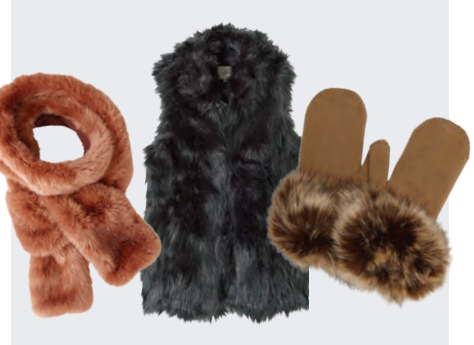
INDIGO SCARF, $50, CHAPTERS.INDIGO.CA LOFT VEST, $178, LOFT.CA. ALDO MITTENS, $18, ALDOSHOES.COM

Fur, both real and faux, offers a fresh way to add luxe glamour to winter dressing. For immediate impact, add a faux-fur vest to an LBD, or use an infinity scarf and mittens with major fringe to amp up a classic wool coat.