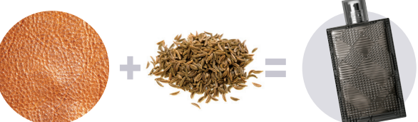
A LEATHER HEART SEASONED WITH SPICY CUMIN SEED AND PEPPER OIL. BURBERRY BRIT RHYTHM INTENSE FOR MEN, $97 (90 ML), BURBERRY COUNTERS