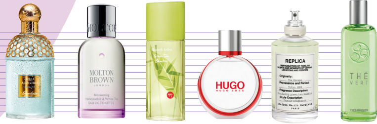
GUERLAIN AQUA ALLEGORIA TEAZZURRA EAU DE TOILETTE, $70 (75 ML), GUERLAIN BOUTIQUES; MOLTON BROWN BLOSSOMING HONEYSUCKLE & WHITE TEA EAU DE TOILETTE, $65 (50 ML), MOLTONBROWN.COM; ELIZABETH ARDEN GREEN TEA BAMBOO EAU DE TOILETTE SPRAY, $56 (100 ML), DRUGSTORES; HUGO BOSS HUGO WOMAN EAU DE PARFUM, $75 (50 ML), HUGO BOSS BOUTIQUES; MAISON MARTIN MARGIELA REPLICA TEA ESCAPE, $115 (100 ML), SEPHORA.COM; YVES ROCHER UN MATIN AU JARDIN THE VERT EAU DE TOILETTE, $32 (100 ML), YVESROCHER.CA