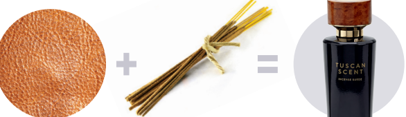
SUEDE WITH INCENSE, TOBACCO AND PINK PEPPER. SALVATORE FERRAGAMO TUSCAN SCENT INCENSE SUEDE, $260 (50 ML), HOLT RENFREW