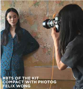
#BTS OF THE KIT COMPACT WITH PHOTOG FELIX WONG

Actor Freida Pinto aced daytime elegance at the Amazon Prime Summer Soiree in Los Angeles. Spritz dry hair with heat-protecting spray and brush it through. Hold a waver wand upside down, and wrap two-inch sections of hair away from the face, starting a few inches below the root and leaving the ends straight. Allow to cool, mist with hairspray and run your fingers through to break the curls. Exfoliate lips with a scrub or washcloth and apply a full-coverage magenta liquid lipstick. —Natasha Bruno