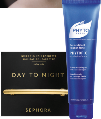
SEPHORA COLLECTION DAY TO NIGHT BARRETTE, $10, SEPHORA. PHYTO PROFESSIONAL STRONG SCULPTING GEL, $26, SHOPPERS DRUG MART

Hairstylist Syd Hayes combed the hair straight back into a tight ponytail, slicking down the top and sides with a strong-hold gel. He then crimped the entire tail before folding it into a bun, leaving a few inches loose, and secured the base with bobby pins. —Natasha Bruno