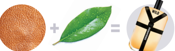
WET EARTH AND FOLIAGE MEET A WARM "NEOLABDANUM" ACCORD, ALL WRAPPED IN A LEATHER HARNESS. DSQUARED2 WILD, $68 (50 ML), HUDSON'S BAY