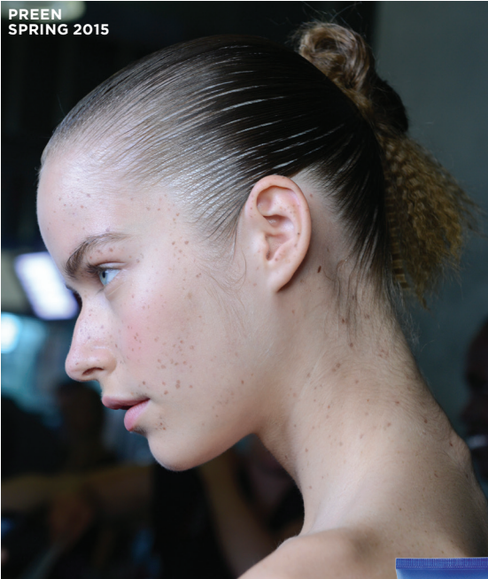
PREEN SPRING 2015