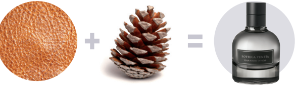
LEATHER TAKEN OUTSIDE, PAIRED WITH FOREST PINE AND JUNIPER BERRIES. BOTTEGA VENETA POUR HOMME EXTRÊME, $90 (50 ML), HOLT RENFREW

Whether it's a handbag or fresh-from-the-dealer leather seats, the scent is irresistible for men and women alike. Here, five new ways to enjoy those deep, rich notes.