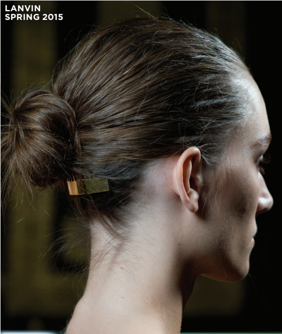
LANVIN SPRING 2015

DAILY DOSE GET YOUR FASHION AND BEAUTY NEWS UPDATES EVERY MORNING AT THEKIT.CA