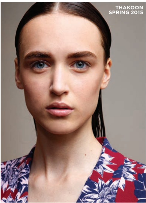
THAKOON SPRING 2015