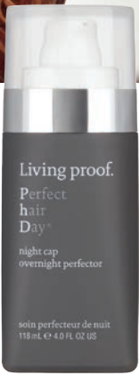
LIVING PROOF PERFECT HAIR DAY NIGHT CAP OVERNIGHT PERFECTOR, $34, SEPHORA.CA

Aniston comes to the rescue of other people's parched locks too. "A friend of mine had her hair coloured with balayage a few weeks ago, and it was just fried. She drenched her hair in the Night Cap and the life came back to it." The actor recognizes though, that there's no way to avoid bad hair days altogether. "I have very few now, but every human being has a bad hair day—even the guys." Speaking of unavoidable, I ask what she thinks about the return of the Rachel haircut and am gently put in my place like a stray strand: "You're asking the wrong question. I don't think the Rachel ever left, did it?"