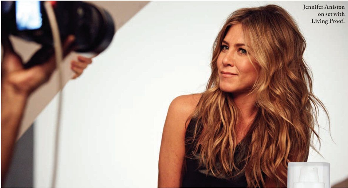
Jennifer Aniston on set with Living Proof.

She remedies dry, sun-fried hair with a "reboot" in the form of a deep-conditioning treatment every Sunday, using a new overnight mask called Night Cap Overnight Perfector. "At first I thought, 'You're asking me to put lotion on my head at night and I'm not going to wake up with a greasy head of hair or