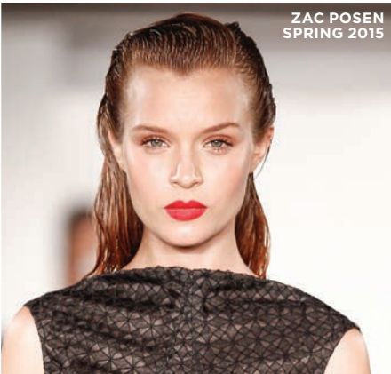
ZAC POSEN SPRING 2015