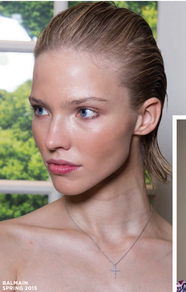
BALMAIN SPRING 2015