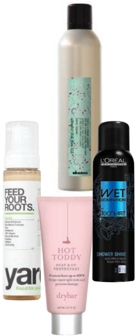
YAROK FEED YOUR ROOTS MOUSSE, $17, LOVEHUSK.COM. DAVINES THIS IS A STRONG HAIR SPRAY, $34, SALONS. L'OREAL PROFESSIONNEL WET DOMINATION BY TECNI.ART SHOWER SHINE, $26, SALONS. DRYBAR HOT TODDY HEAT PROTECTOR FRIZZ FIGHTER, $38, SEPHORA.CA.

The owner of arguably the most recognized tousled Californian locks on the planet, Jennifer Aniston shares her summer-hair tips