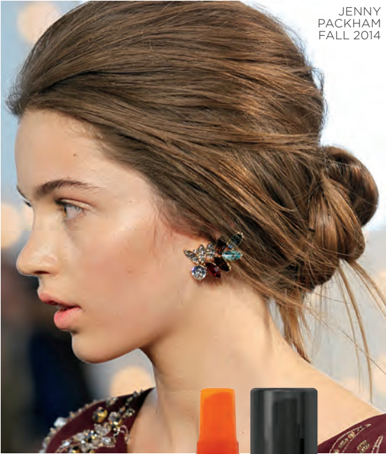
JENNY PACKHAM FALL 2014