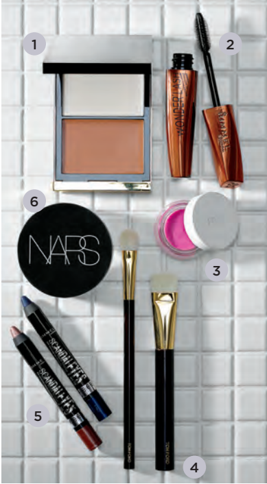
1. TOM FORD SHADE AND ILLU-MINATE, $84, HOLT RENFREW. 2. RIMMEL LONDON WONDERLASH MASCARA, $9, DRUGSTORES. 3. RMS BEAUTY LIP SHINE IN SUBLIME, $25, RMSBEAUTY.COM, THEDETOXMARKET.COM. 4. TOM FORD EYESHADOW BRUSH, $62, AND SHADE AND ILLUMINATE BRUSH, $80, HOLT RENFREW.

Above all, she keeps things simple—orange eyeshadow notwithstanding. "I try to give my skin a rest when I am not working," she says. "I really just use the minimum amount of products."