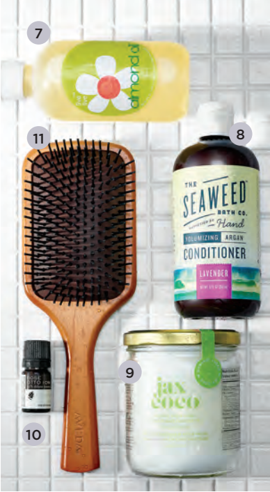
5. RIMMEL LONDON SCANDALEYES SHADOW STICKS IN BLUFFING AND NAUGHTY NAVY, $7 EACH, DRUGSTORES. 6. NARS TRANSLUCENT LIGHT REFLECTING SETTING POWDER, $52, SEPHORA.CA. 7. BEE YUMMY ALMOND OIL, $19, LIVE-LIVE.COM. 8. SEAWEED BATH CO. ARGAN CONDITIONER, $15, WELL.CA.