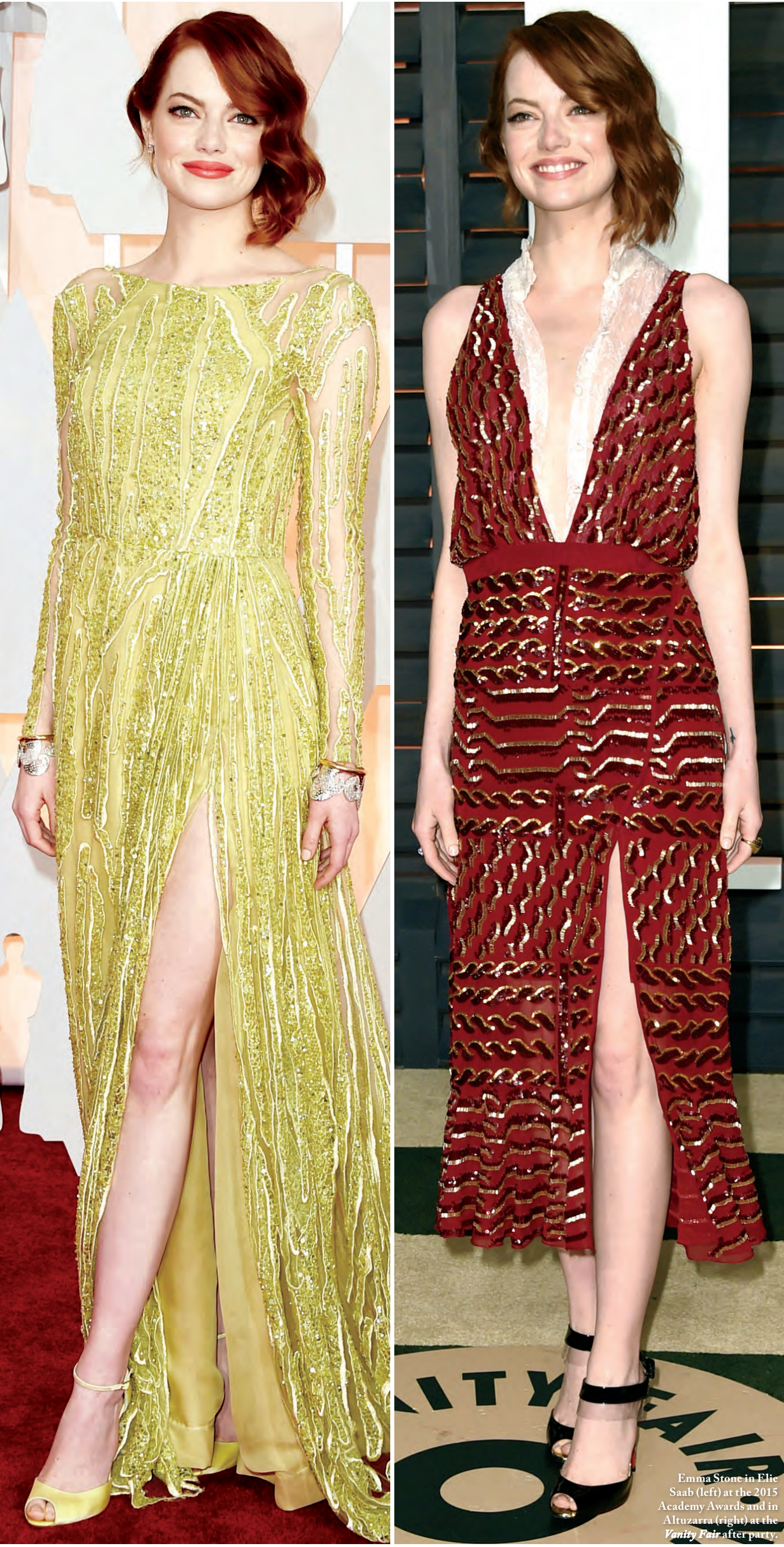
Emma Stone in Elie Saab (left) at the 2015 Academy Awards and in Altuzarra (right) at the Vanity Fair after party.

REAL LESSONS IN AWARD-WINNING STYLE From magical gowns to positive messages—this year’s Oscars were more inspiring than ever. Sequins and sparkle shared the spotlight with important causes including #equalpay and #askhermore and we were happy to hashtag along Pages 4 to 7