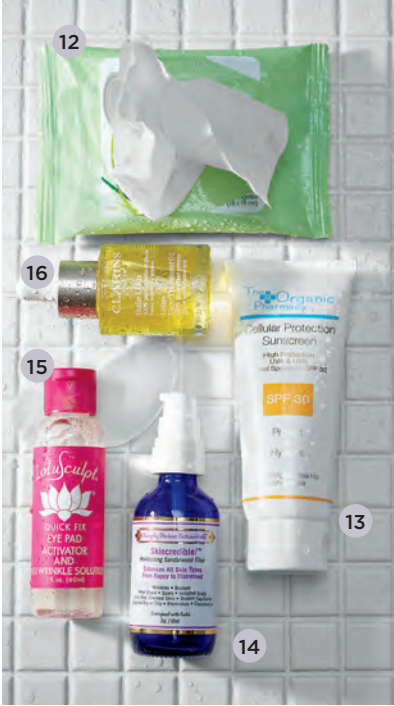
9. JAX COCO COCONUT OIL, $19, AMAZON.CA. 10. ESSENTS ROSE OTTO ESSENTIAL OIL 100% PURE, $138, ESSENTS.CA. 11. AVEDA PADDLE BRUSH, $29, AVEDA.CA. 12. SIMPLE CLEANSING FACIAL WIPES, $8, DRUGSTORES. 13. THE ORGANIC PHARMACY CELLULAR PROTECTION SUNSCREEN SPF 30, $80, THEORGANICPHARMACY.COM. 14. SIMPLY DIVINE BOTANICALS SKINCREDIBLE! REVITALIZING SANDALWOOD ELIXIR, $47, SIMPLYDIVINEBOTANICALS.COM. 15. TRACIE MARTYN LOTUS-CULPT QUICK FIX EYE PADS, $45, AND ACTIVATOR, $50, GEEBEAUTY.COM. 16. CLARINS LOTUS FACE OIL TREATMENT, $53, SHOPPERS DRUG MART.