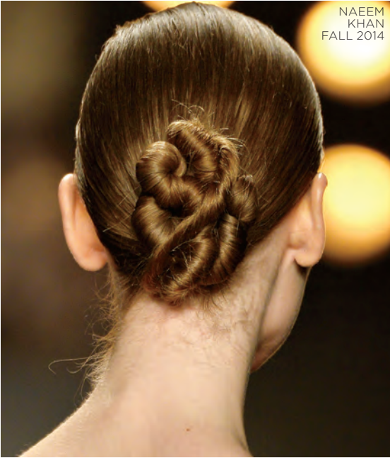
NAEEM KHAN FALL 2014

LONG-WEAR LIPS MAKE YOUR LIPSTICK LAST WITH THESE 10 PRO TIPS AT THEKIT.CA/RED-LIPSTICK-MUSTS/