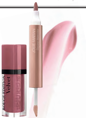
BOURJOIS PARIS ROUGE EDITION VELVET IN NUDE-IST, $23, SHOPPERS DRUG MART. JOSIE MARAN COCONUT WATERCOLOR LIP STAIN & SHINE IN HONEYMOON HONEY, $28, SEPHORA.CA. LANCÔME LIP LOVER IN ROSE MONCEAU, $29, DEPARTMENT STORES.