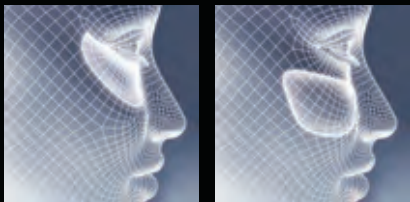
UNDER-EYE AND CHEEK AREAS

IN JUST 4 WEEKS, SEE INCREASED FULLNESS IN CHEEKS. PLUS A LESS HOLLOWED LOOK UNDER THE EYE AREA. FINE LINES AND WRINKLES LOOK REDUCED. SMOOTHER, MORE EVEN SKIN TEXTURE.