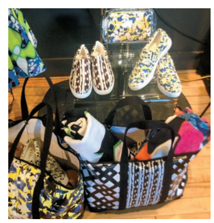
We wanted everything at the Target spring preview. (Especially in the Peter Pilotto line.)

Candid photo-shoot outtakes, in-office antics, events and more! Get your behind-the-scenes fix at instagram.com/thekitca