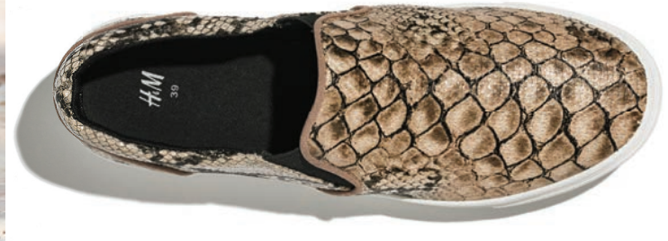
NATURAL WONDERS An oversized serpentine finish leads simple sneakers to walk on the wild side. H&M snakeskin print sneakers, $35, at H&M and hm.com/ca