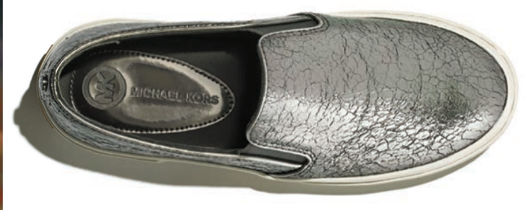
QUICK SILVER All the thrill of metallic party heels, none of the toe-crunching regrets. Michael Michael Kors Boslip sneakers, $128, at Capezio and capezioshoes.ca