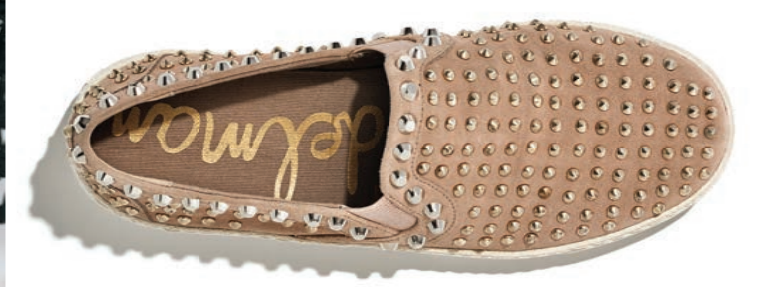
WHAT A STUD With hardware in rose gold and silver, underscored by a blush hue, punk merges with pretty. Sam Edelman Braxton sneakers, $140, available at Hudson's Bay and thebay.com