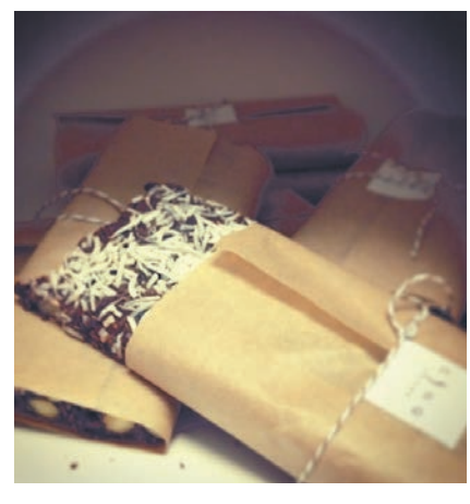
Delicious fresh granola bars from @CinqFoods. #yum