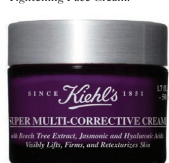
KIEHL'S SUPER MULTI-CORRECTIVE CREAM. $68, KIEHLS.CA

what's new is the way they're being formulated. Combining collagen-stimulating peptides with botanicals like algae yields maximum effectiveness, as we see in the latest Strivectin Tightening Face Cream.