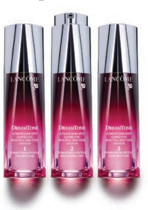
LANCÔME DREAMTONE CUSTOMIZED SKIN TONE CORRECTING SERUM, $110, LANCOME.CA

The end game with each pearlescent cream is to have a more uniform complexion, so it delivers immediate luminosity and long-term correction benefits.