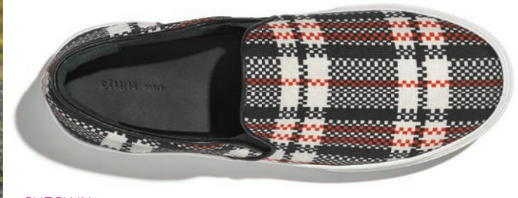
From cropped trousers to leather leggings, a digital take on plaid will give any look a boost. Céline checkered sneakers, $650, at Holt Renfrew