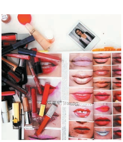
There's a lot of research that goes into a beauty story. (Our kind of research!)