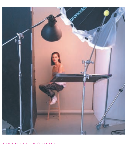
Siting pretty during the photo shoot for our April cover (it's all about spring makeup.)

OUR FAVOURITE ITEMS FROM E-TAILERS WE LOVE