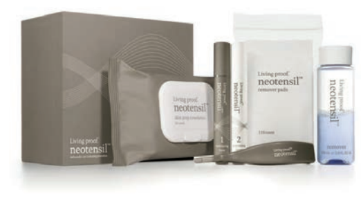
Obagi Neotensil Daily Under-Eye Reshaping Procedure Complete, $500

noticeably improved eye contours will keep you looking fresh all day long.