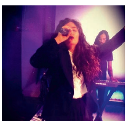
SINGING PROUD Lorde regaled guests with an 8-song set at the New York launch of her collaboration.