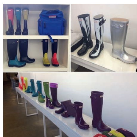
RE-BOOT A wall of rubber boots has us feeling like a kid in a candy store @HunterBoots @jga_pr