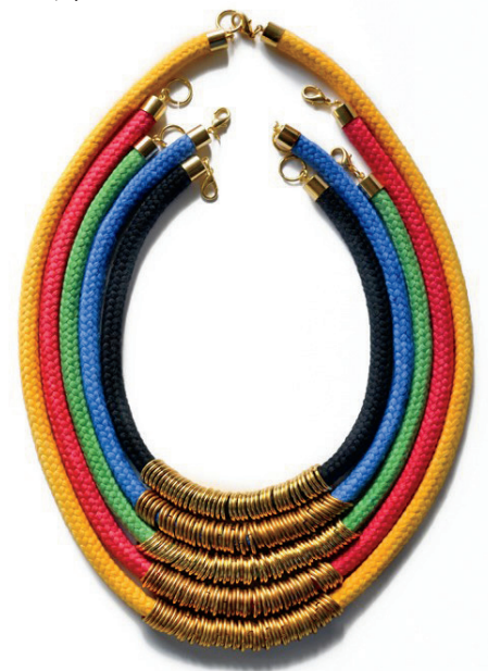
Reason To Be Pretty Loops Necklace, $77