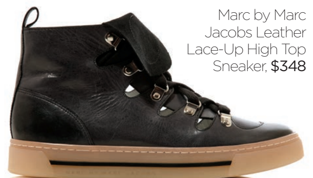
Marc by Marc Jacobs Leather Lace-Up High Top Sneaker, $348

How to Wear the High Top. There's no question that high-top sneakers are having a fashion moment. The beauty of it is you can wear them with just about anything. You can't go wrong with skinny jeans, but why not try them with leather leggings, harem pants or a short dress? We love this all-leather style from Marc by Marc Jacobs, because of its classic shape and unique design. Did you notice the cut outs along the lace hooks and extra wide laces?