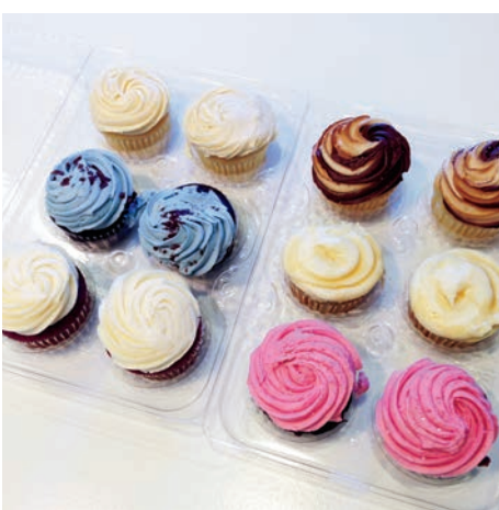
THE KIT DOES BRITHDAYS These cupcakes are gluten-, sugar- and fat-free. Kidding!

Go behind the scenes with our team at photo shoots, events and more. Follow us at instagram.com/thekitca