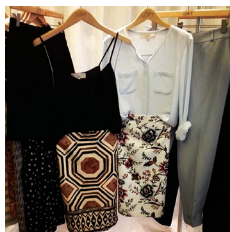
PENCIL THIS IN Must-have for a summer work wardrobe: a chic statement pencil skirt @loftcanada