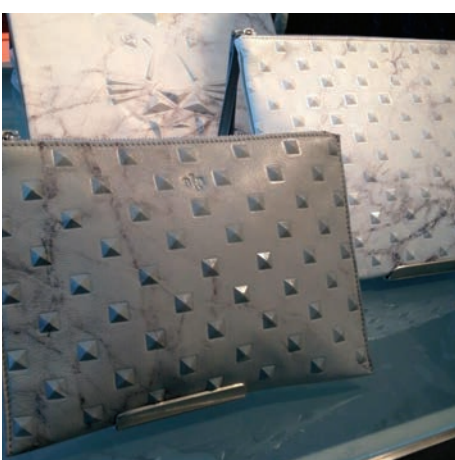
WE LOST OUR MARBLES Can't get enough of this marbled finish on @elahandbags @HoltRenfrew