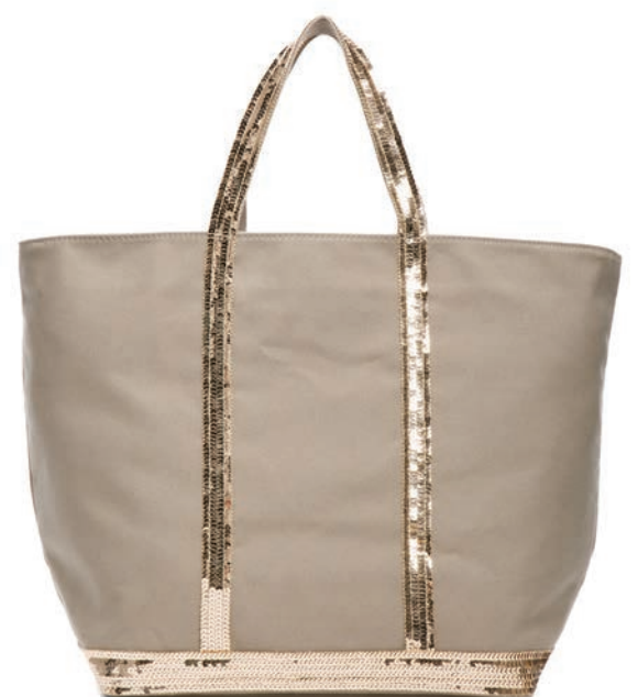
Vanessa Bruno Toile De Coton Tote, $262* *U.S. dollars.

Add a little sparkle to your run-around-town look with this cotton tote from Vanessa Bruno. The gold sequin trim and taupe canvas combine playful glamour with everyday versatility.