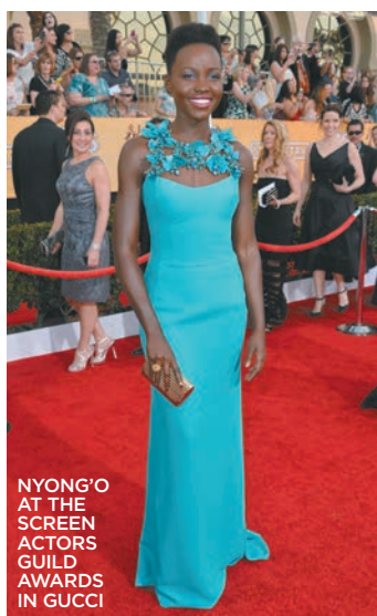
NYONG'O AT THE SCREEN ACTORS GUILD AWARDS IN GUCCI