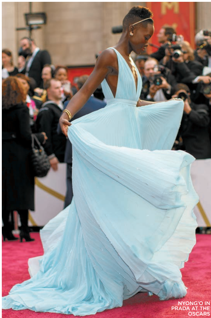
NYONG'O IN PRADA AT THE OSCARS