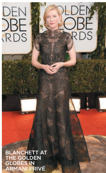
BLANCHETT AT THE GOLDEN GLOBES IN ARMANI PRIVÉ

Blanchett's makeup is as simple and striking as her style. Regardless of the gown she wears, Blanchett eschews trendy beauty statements for healthy-looking elegance: Her cheekbones look sculpted and her complexion is radiant.