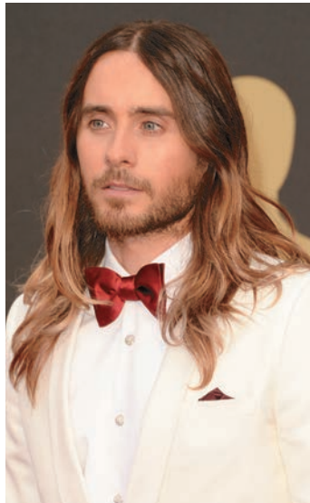
CRIMSON COOL JARED LETO IN SAINT LAURENT