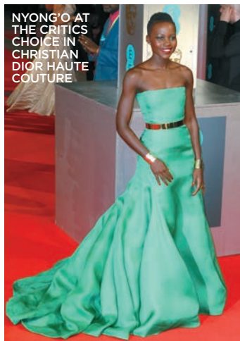
NYONG'O AT THE CRITICS CHOICE AWARDS IN CHRISTIAN DIOR HAUTE COUTURE