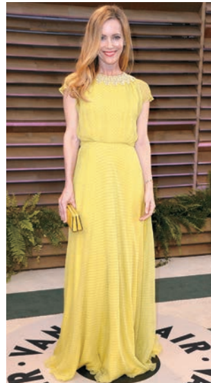
SUNNY SIDE LESLIE MANN IN JENNY PACKHAM