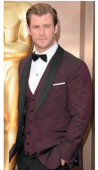
MAROON HIGH-FIVE CHRIS HEMSWORTH IN DAVID AUGUST