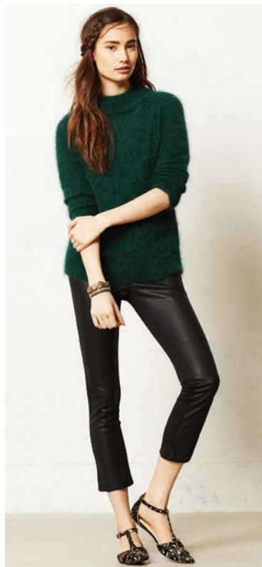
JBRAND LEATHER LEGGINGS, $794, AT ANTHROPOLOGIE.COM

ONLINE FOR YOUR DAILY DOSE OF FASHION AND BEAUTY NEWS READ RADAR EVERY MORNING AT THEKIT.CA