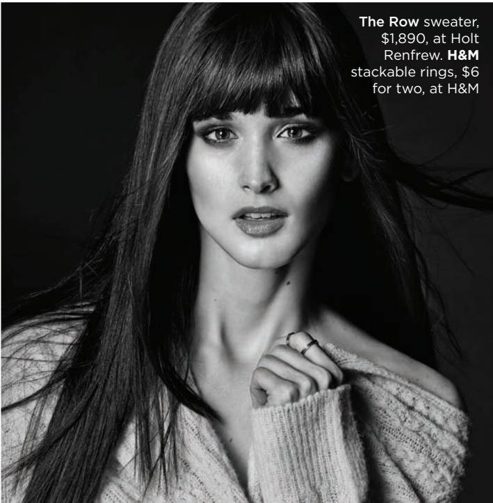
The Row sweater, $1,890, at Holt Renfrew. H&M stackable rings, $6 for two, at H&M