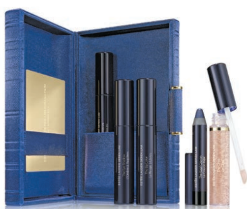
92 The Estée Lauder x Derek Lam makeup collaboration. In fact, designer collaborations, period. What easier way to have a taste of the designer pie? $95, Holt Renfrew, esteelauder.ca.