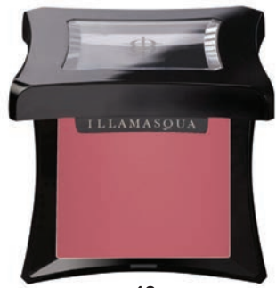
46 Illamasqua Cream Blusher in Peaked—a blendable pink to suit any complexion for any season, $26, Hudson's Bay.