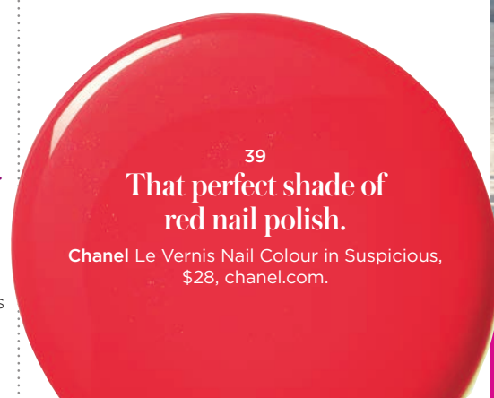
39 That perfect shade of red nail polish.