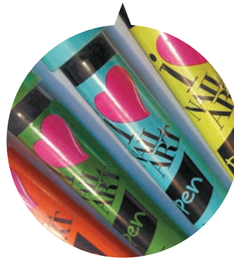
3 Sally Hansen nail-art tools. Coming next month: new nail-art pens, neon polishes and embellishment kits packed with beads, studs, glitter and fringe. Perfect for creative at-home manis. From $5 to $7, at drugstores from February.