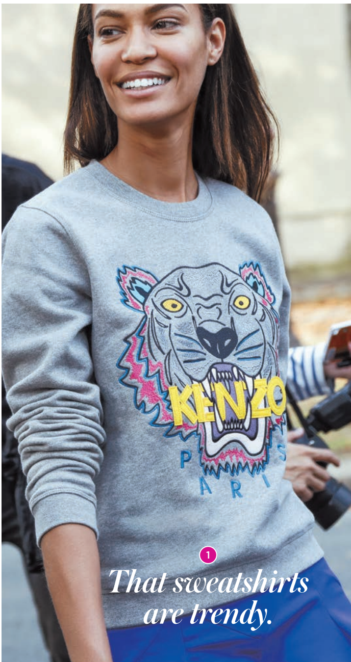
1 That sweatshirts are trendy.