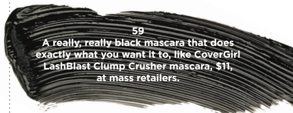
59 A really, really black mascara that does exactly what you want it to, like CoverGirl LashBlast Clump Crusher mascara, $11, at mass retailers.

58 A-list directors—including Martin Scorsese, Baz Luhrmann, David Lynch, Wes Anderson and Roman Coppola—creating dreamy imaginative fragrance films. The latest, a Scorsese black-and-white short called "Street of Dreams" for Dolce & Gabbana's The One, stars Scarlett Johansson and Matthew McConaughey in a retro Manhattan setting.