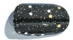
26 STICK-ON NAILS. Sally Hansen Salon Effects Real Nail polish strips in Lust-rous, $16, at drugstores.