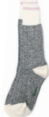
30 Roots classic wool socks. Ideal for channelling the cottage vibe, $19, Roots stores.