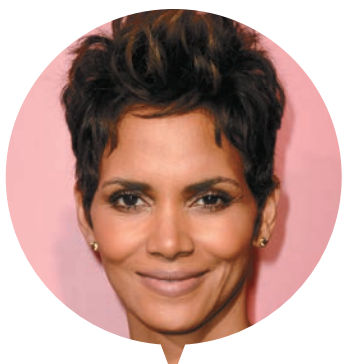
16 Chicks with cool, cropped locks.