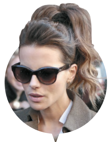
80 This headline: "The Return of the Scrunchie: A Hair-Raising Tale." And that Kate Beckinsale, Jennifer Aniston and Sienna Miller have sported them and Marc Jacobs is now making a designer version.