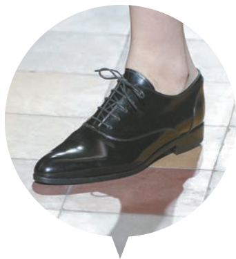
45 Glossy black oxfords.