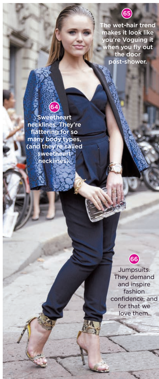
65 The wet-hair trend makes it look like you're Voguing it when you fly out the door post-shower.

90 The dramatic plot lines, wardrobes and flawless, makeup of our top shows: Scandal, Revenge, The Good Wife.