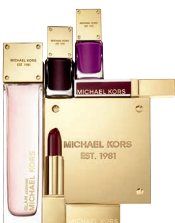
29 The Michael Kors Beauty and Fragrance Collection: He's a master at dressing women well, so why wouldn't he take us as inspiration for a fragrance and cosmetic line? From $20, Hudson's Bay and michaelkors.com.