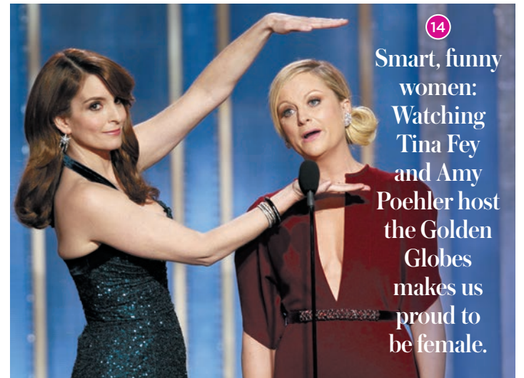
14 Smart, funny women: Watching Tina Fey and Amy Poehler host the Golden Globes makes us proud to be female.

15 SPANDEX AND LYCRA BLENDS. WE OWE A DEBT OF GRATITUDE TO DUPONT. MUFFIN TOPS, BE GONE!