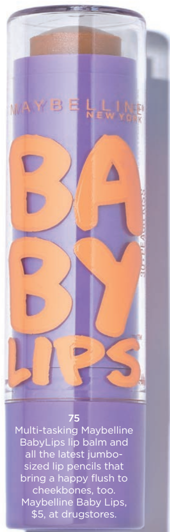
75 Multi-tasking Maybelline BabyLips lip balm and all the latest jumbo-sized lip pencils that bring a happy flush to cheekbones, too. Maybelline Baby Lips, $5, at drugstores.

76 Classic short cocktails that continue to rock our worlds. (Make ours an old-fashioned, please.)