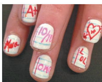
85 AFFIRMATION MANIS. Emblazon your nails with inspiring messages.

84 Dark, delicious oud wood, as in Tom Ford's Oud Wood, Valentina Oud Assoluto or Jo Malone London's new Oud & Bergamot Cologne Intense.