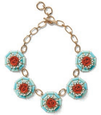
25 STATEMENT NECKLACES. (They're still making statements!) Necklace, $110, bananarepublic.ca.