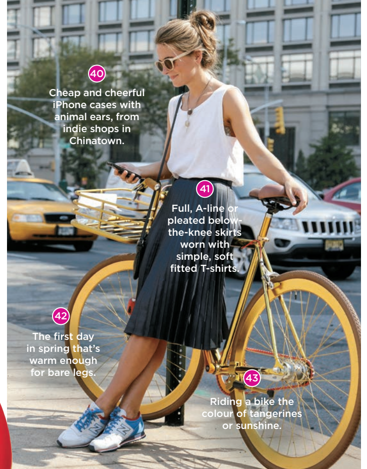
40 Cheap and cheerful iPhone cases with animal ears, from indie shops in Chinatown.