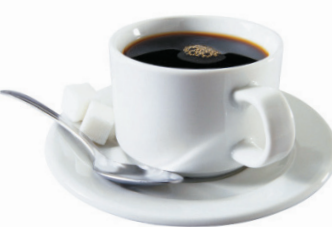
24 That first cup of freshly brewed coffee in the morning.