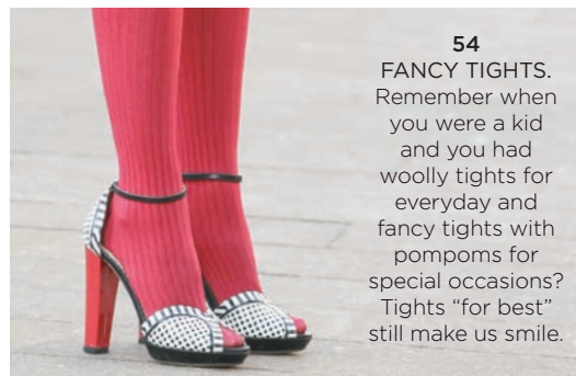
54 FANCY TIGHTS. Remember when you were a kid and you had woolly tights for everyday and fancy tights with pompoms for special occasions? Tights "for best" still make us smile.

53 POP-UP SHOPS. An empty store suddenly becomes a curated collection of local hand-made items or lesser-known designers.