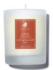
100 Candles scented with your favourite notes (like fig and freesia).

99 In the summer, hearing the jingle of the ice cream truck and nabbing a treat right before dinner.