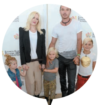
82 FAMILY. Hot celebrity families.

74 Getting ready to go out, with friends, music and a glass of vino.