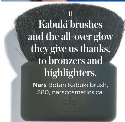
11 Kabuki brushes and the all-over glow they give us thanks, to bronzers and highlighters. Nars Botan Kabuki brush, $80, narscosmetics.ca.

10 DINNER WITH GIRLFRIENDS. DINNER WITH YOUR DAUGHTER. DINNER WITH YOUR MOM.