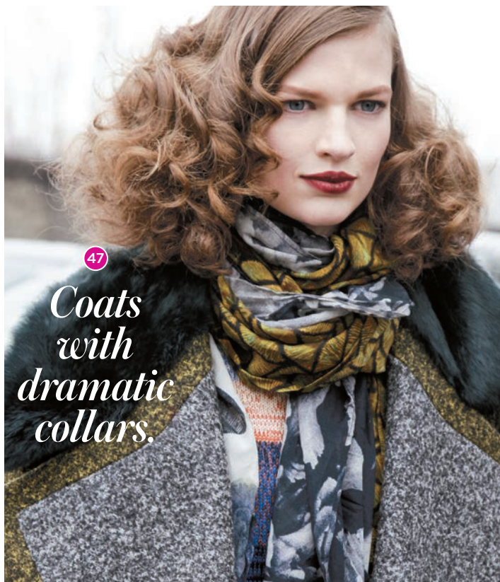
47 Coats with dramatic collars.

49 Learning your favourite fill-in-the-blank beauty product that was discontinued years ago is finally being re-released.