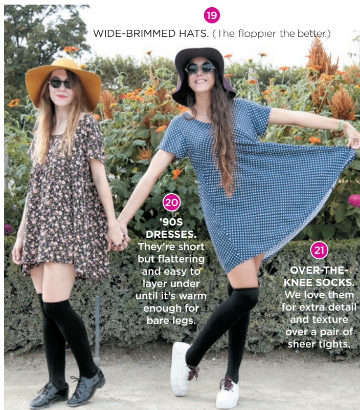
19 WIDE-BRIMMED HATS. (The floppier the better.)