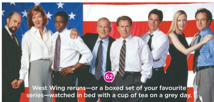
62 West Wing reruns—or a boxed set of your favourite series—watched in bed with a cup of tea on a grey day.

63 A new product. Tearing off the packaging, reading the back and using it for the first time.