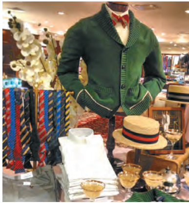
Scouting The Great Gatsby collection at Brooks Brothers

Get your behind-the-scenes fix at instagram.com/the_kit . Candid photo-shoot outtakes, in-office antics, events and more.