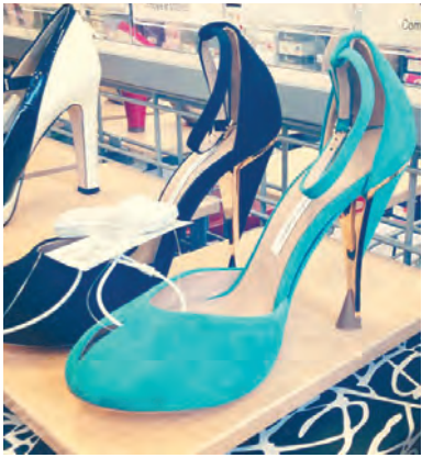
Funky DVF heels at the new Marshalls Toronto opening