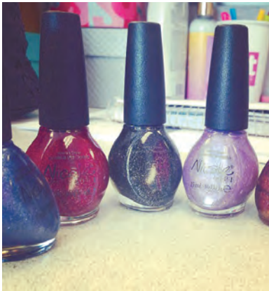
Pretty summer polishes arrive for our review (we love our jobs!)