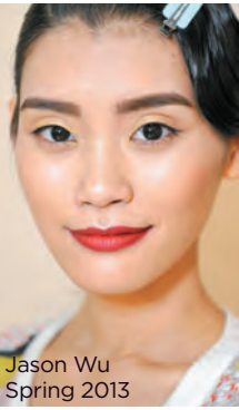
Jason Wu Spring 2013

Send questions to askjeanne@thekit.ca . Jeanne Beker is a contributing editor to the Toronto Star and host of Fashion Television Channel . Follow on Twitter @Jeanne_Beker.