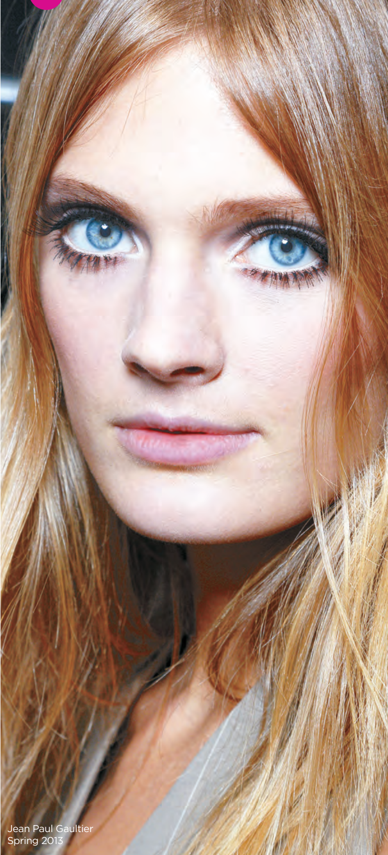
Jean Paul Gaultier Spring 2013

web Get more beautiful ideas at TheKit.ca