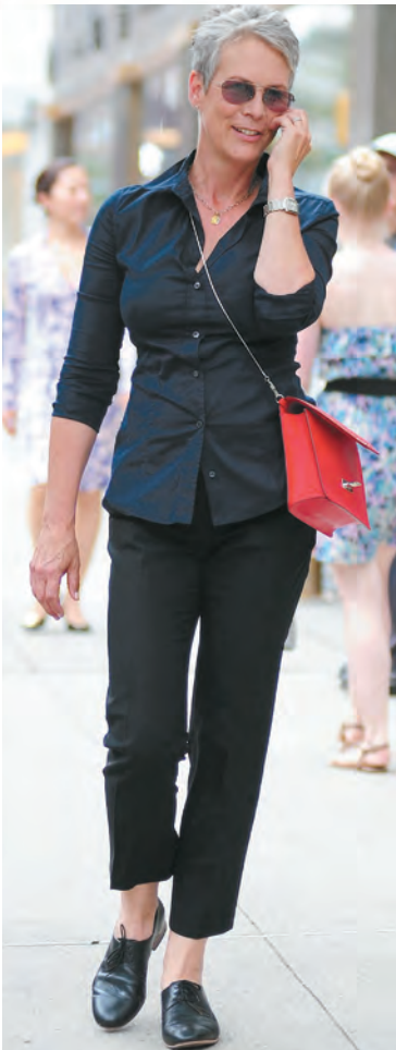
Jamie Lee Curtis, 54

Layered over a denim shirt and a floaty dress with leggings, this messenger bag finishes off a boho-style outfit that's perfect for running errands and weekend jaunts.