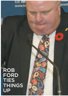
ROB FORD TIES THINGS UP

It's often hard to lend our own sense of style and aesthetics to others. And in some cases, it can be a dangerous and rather rude thing to do. Most of us could use a little more personality and even eccentricity in our approach to dressing. If your dad is happy with images of the Road Runner or Santa Claus around his neck, you might just want to let him be. Then again, exposing anyone to the "chic side" can never hurt. Whether they want to walk on it is up to them.