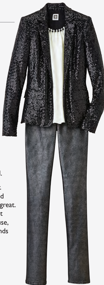
Anne Klein Sequin Blazer, $189. Sleeveless Blouse, $79. Leo Straight Jeans, $99.