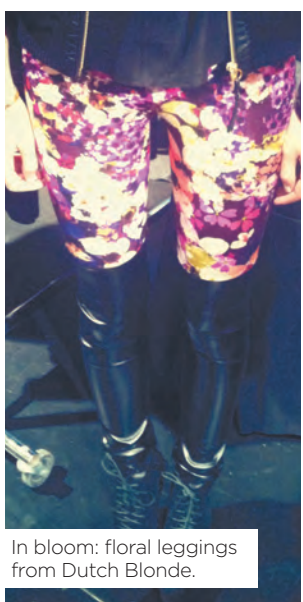
In bloom: floral leggings from Dutch Blonde.

Visit instagram.com/the_kit to join us behind the scenes. See our candid pictures from photo shoots, events and more.