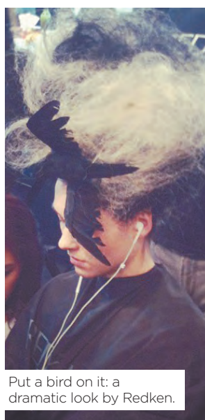
Put a bird on it: a dramatic look by Redken.