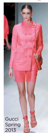
Gucci Spring 2013

With warm weather ahead, most of us would be inclined to go the bare leg route when wearing these shorts. And that's okay, but keep in mind that, just as with skirts, one of the keys to wearing cocktail shorts well is what's on your feet. A flat, strappy evening sandal or a wedge will work well for an outdoor garden party. The new, streamlined