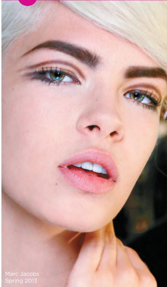
Marc Jacobs Spring 2013

web Get more dazzling eye-makeup looks (with tutorials!) at TheKit.ca