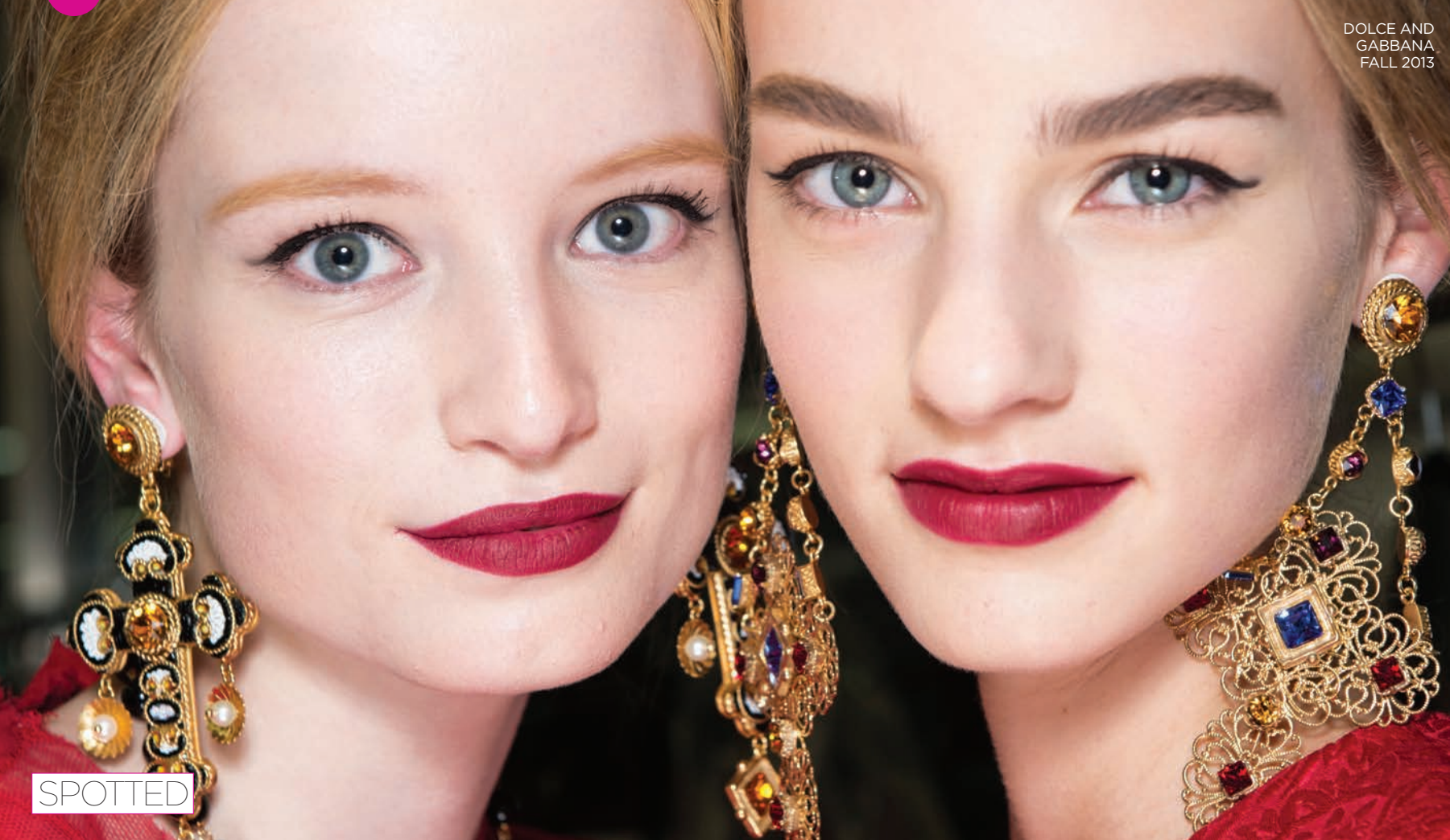
DOLCE AND GABBANA FALL 2013