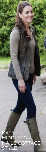
KATE MIDDLETON NAILS COTTAGE STYLE

Send questions to askjeanne@thekit.ca . Jeanne Beker is a contributing editor to the Toronto Star and host of Fashion Television Channel. Follow on Twitter @Jeanne_Beker