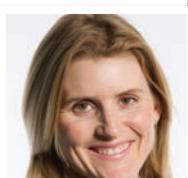
VANCOUVER, BC - JULY 13 Hayley Wickenheiser Four-time Olympic Medallist Captain - Women's National Hockey Team