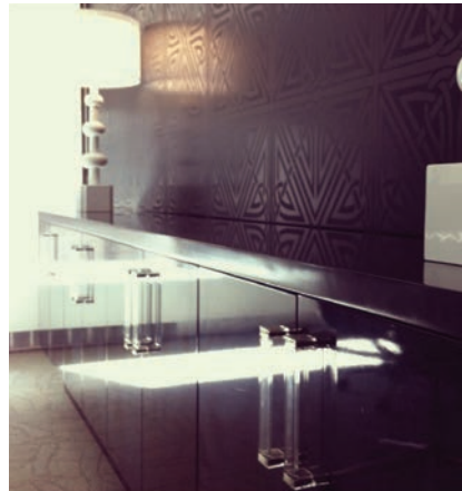
THE OFFICE MAKEOVER CONTINUES! A Friday morning treat from @LisaCanning: delivery of a custom console for our boardroom.