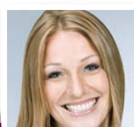
HALIFAX, NS - AUG 10 Heather Moyse 2010 Olympic Bobsleigh Gold Medallist Two-time Women's Rugby World Cup Leading Try Scorer

Inspirational Speakers presented by ONE A DAY