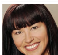
OTTAWA, ON - AUG 24 QUEBEC CITY, QC - SEPT 21 Chantal Petitclerc 21 Paralympic medals (including 14 gold medals), Chef de Mission for the Glasgow 2014 Commonwealth Games