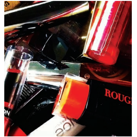
IN SEARCH OF A PERFECT POUT National Lipstick Day meant time to ogle the lipstick collection in The Kit's fashion closet!