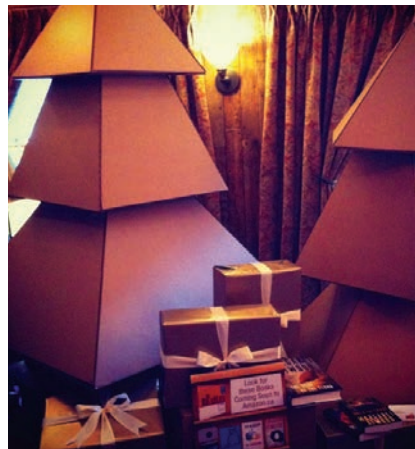
CHRISTMAS IN AUGUST Amazon.ca gave us a sneak peek of what could be under the tree for the holidays this year.

Get your behind-the-scenes fix at instagram.com/the_kit . Candid photo-shoot outtakes, in-office antics, events and more.