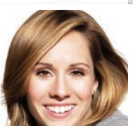
UNIONVILLE, ON - JUNE 22 CALGARY, AB - JULY 27 Jennifer Heil Olympic Gold and Silver Medallist, 2011 Female Athlete of the Year

Experience the inspiring words of an Olympic or Paralympic medallist, a fun run, walk and some awesome swag you are sure to love!