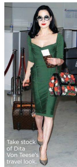
Take stock of Dita Von Teese's travel look.

Jeanne Beker is a contributing editor to the Toronto Star and host of Fashion Television Channel. Follow on Twitter @Jeanne_Beker