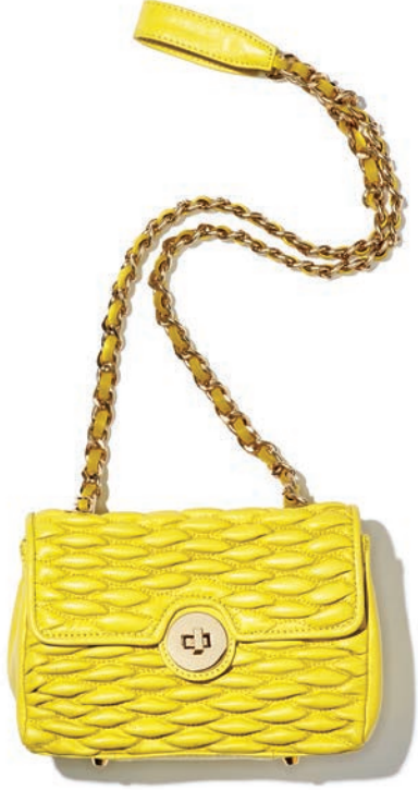
LEMON SQUEEZE Pretty colour, fancy texture, and a delicate chain-link strap: this bag is dressed to party. Quilted bag, $130, at Winners