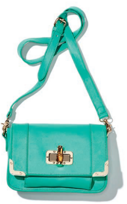
ZEAL FOR TEAL The bold hue is eye-catching, but it's the faux bamboo clasp that seals the gotta-have-it deal. David Dixon bag $90, at Town Shoes, townshoes.com