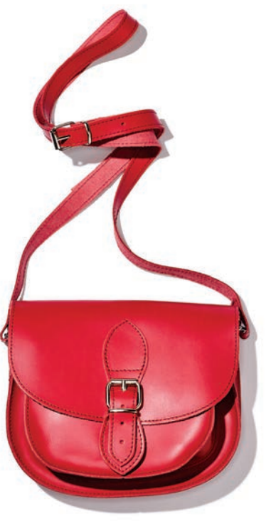
CHERRY BOMB Nothing shakes the dust off a heritage style like a truly juicy shade. Solective Fade Ferchi bag, $105, at Capezio