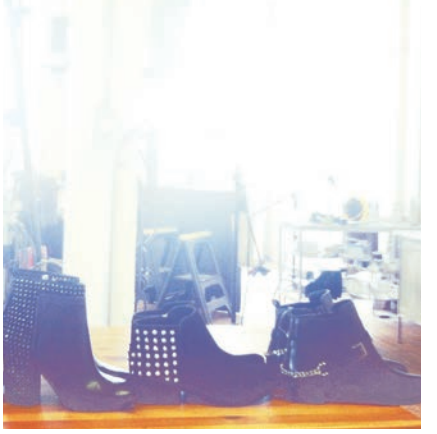
THESE BOOTS WERE MADE FOR... Our October issue! Look out for them strutting across your screen.