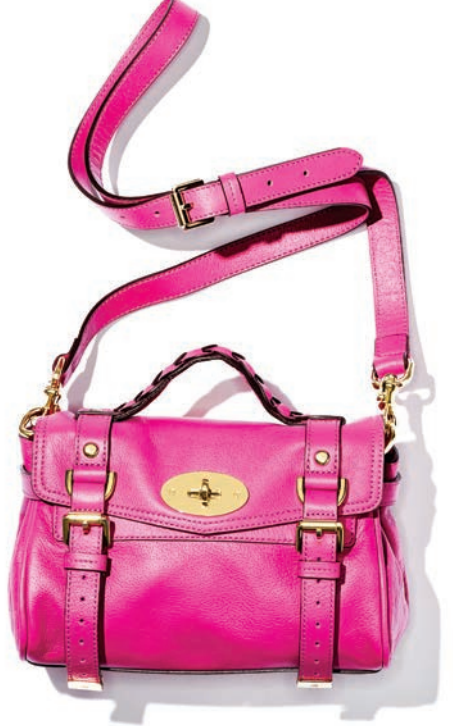
PINK LADY The miniature scale makes this lust-worthy style even more irresistible. Mulberry Mini Alexa bag, $1100, at select Holt Renfrew stores and Mulberry stores

A mini messenger in a vibrant shade really packs a style punch. Whether you're heading to work, shopping on the weekend, or out for cocktails, these light, bright cross-body bags are totally up to (dress) code -INGRIE WILLIAMS