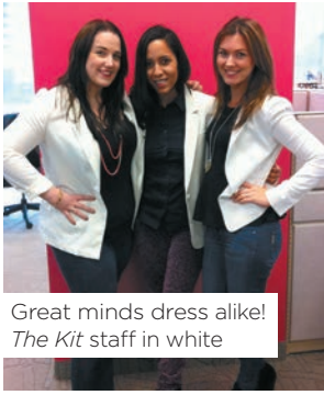
Great minds dress alike! The Kit staff in white