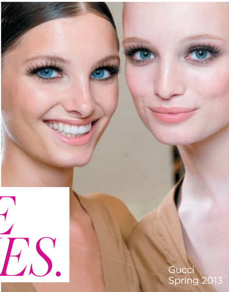
Gucci Spring 2013

10. MULTI-TASKING LIPBALMS. The sheer ones come in the cheeriest colours and most versatile formulas, for use on lips, cheeks—really anywhere you want a little glow. Maybelline New York Baby Lips in Pink Wink, Twinkle and Coral Crush, $5 each, at retailers.