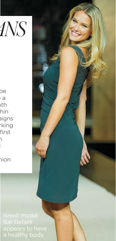
Israeli model Bar Refaeli appears to have a healthy body.