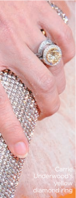
Carrie Underwood's yellow diamond ring

Jeanne Beker is contributing editor to the Toronto Star and host of Fashion Television Channel. Follow her on Twitter @Jeanne_Beker.