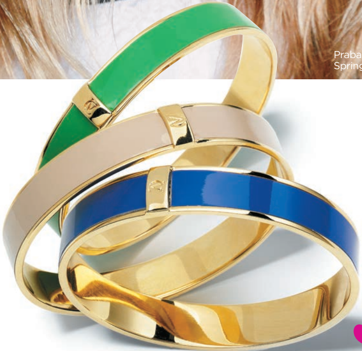
Vince Camuto patent bangles, $38 each, thebay.com

6. FRAGRANCES THAT CAPTURE A TIME AND PLACE. We are smitten with exceptional perfumes that capture bygone romances—from Coco Noir, which distills Coco Chanel's love affair with Venice to Arquiste Parfumeur's Fleur de Louis toilette which captures the air of a 17th-century meeting between a king and his virgin queen. $195 (55 ml), exclusively at Holt Renfrew, arquiste.com