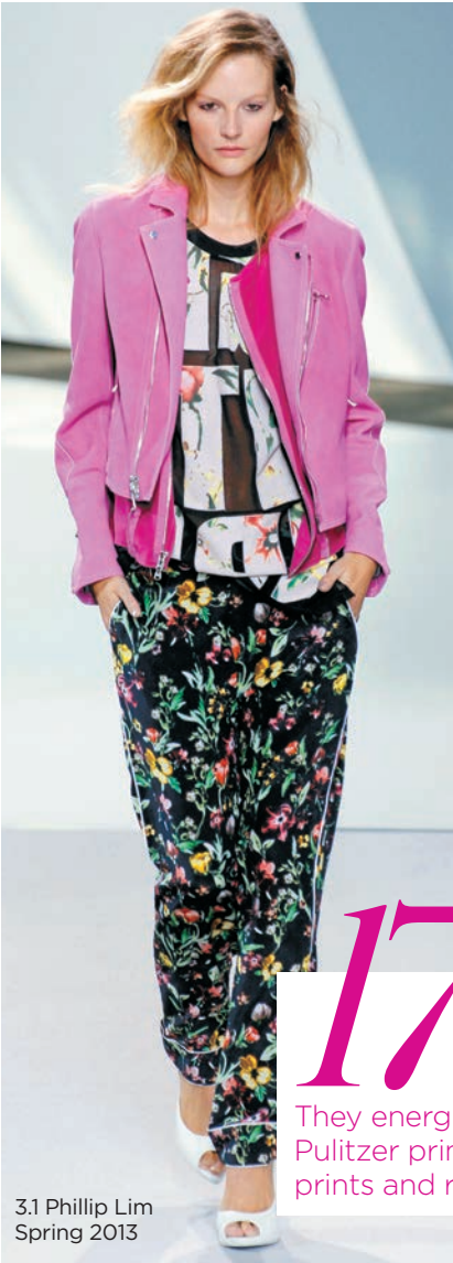
3.1 Phillip Lim Spring 2013

12. OILS. The latest hydrating and restoring oils that soothe our faces, our hair and our limbs—from MoroccanOil's Treatment ($41, moroccanoil.com) to L'Oréal Professionel's grape seed-infused Mythic Oil ($24, ca.lorealprofessionel.com) and Dermalogica's calming Stress Relief Body Oil ($35, dermalogica.com).