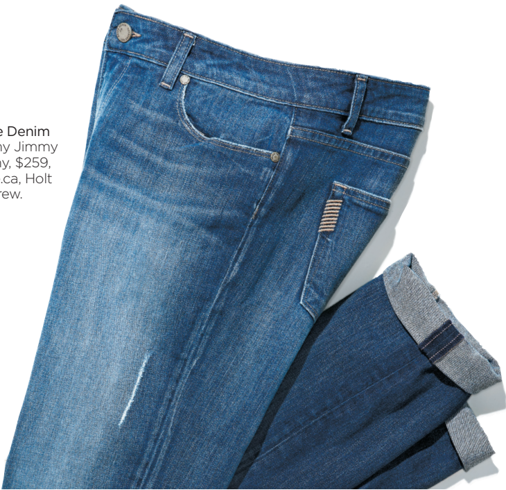
Paige Denim Jimmy Jimmy Skinny, $259, eluxe.ca, Holt Renfrew.