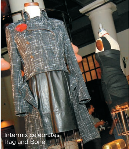
Intermix celebrates Rag and Bone