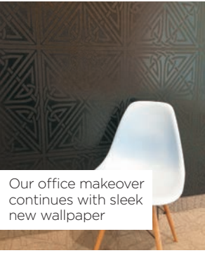
Our office makeover continues with sleek new wallpaper