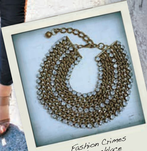
Fashion Crimes bib necklace

Necklace: Expressions exclusive to The Bay Jacket: Zara Pants: Hudson Blouse: Cos Shoes: Ash Bag: Yves Saint Laurent Watch: Marc Ecko Jewellery: Tiffany & Co., Links of London, Topshop, Forever 21, J.Crew, vintage ring