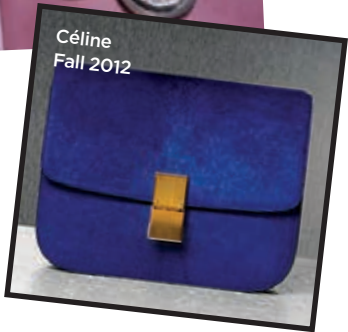
Céline Fall 2012