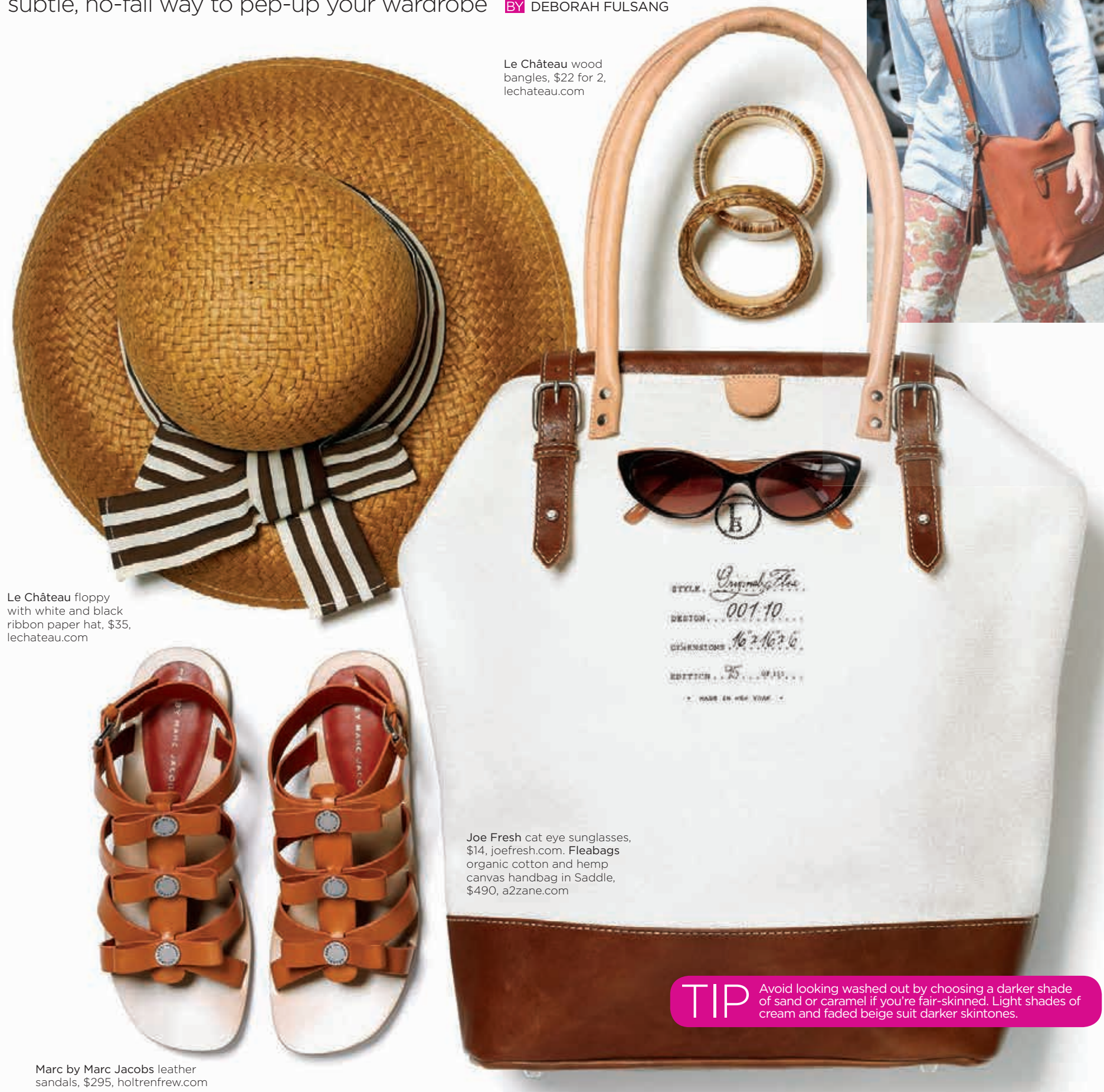
Le Château floppy with white and black ribbon paper hat, $35, lechateau.com