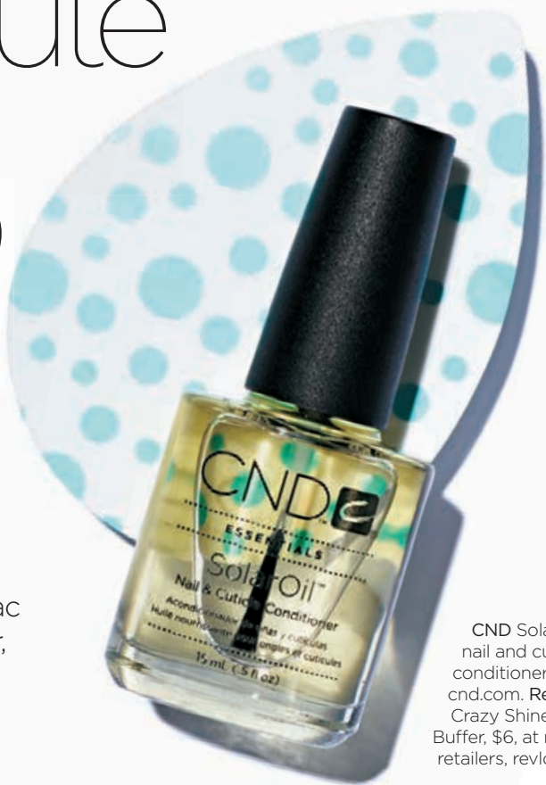
CND Solar Oil nail and cuticle conditioner, $14, cnd.com . Revlon Crazy Shine Nail Buffer, $6, at mass retailers, revlon.ca