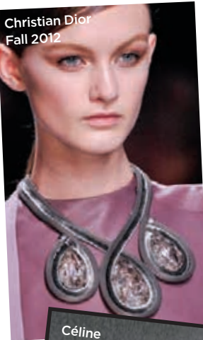
Christian Dior Fall 2012