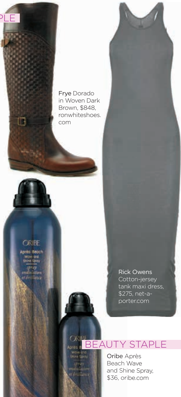
Frye Dorado in Woven Dark Brown, $848, ronwhiteshoes.com