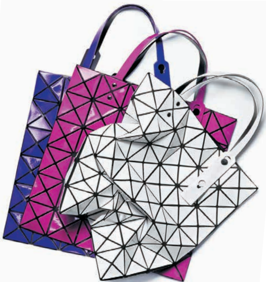
Issey Miyake polyester Boa Boa bags, $495 to $1,250, holtrenfrew.com

This bag quite literally expands with your needs. Part futuristic design, part functional everyday carryall, the Boa Boa line of bags from designer Issey Miyake bends and folds creating a new shape for each wearer. Available in glossy neutral shades and also in bright mirrored metallic shades for a jolt of colour. Any way you wear it, the result is pure architecture arm candy.