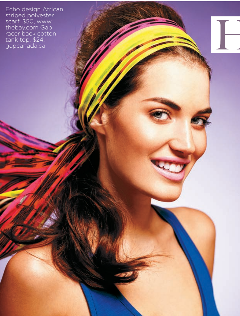
Echo design African striped polyester scarf, $50, www.thebay.com Gap racer back cotton tank top, $24, gapcanada.ca