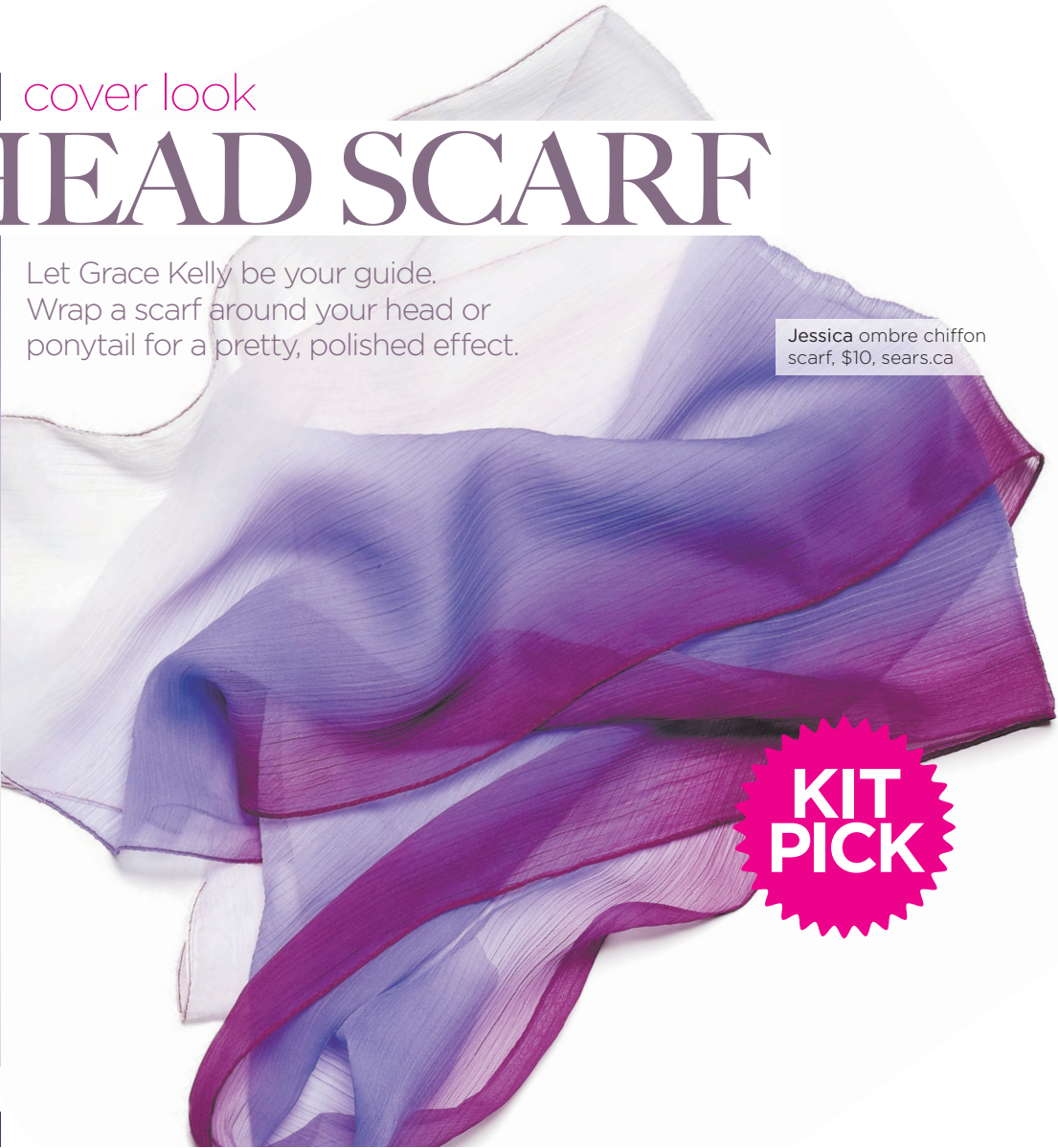
Jessica ombre chiffon scarf, $10, sears.ca

Let Grace Kelly be your guide. Wrap a scarf around your head or ponytail for a pretty, polished effect.