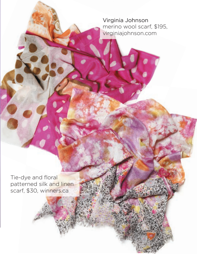
Virginia Johnson merino wool scarf, $195, virginiajohnson.com

Choose colour and pattern—or both—and jazz up a lightweight cardigan or tee with a vibrant, oversized scarf.