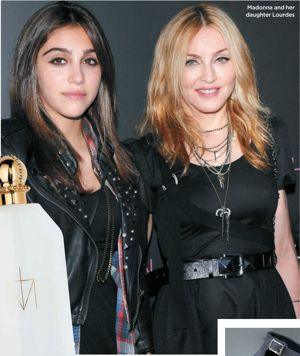
Madonna and her daughter Lourdes