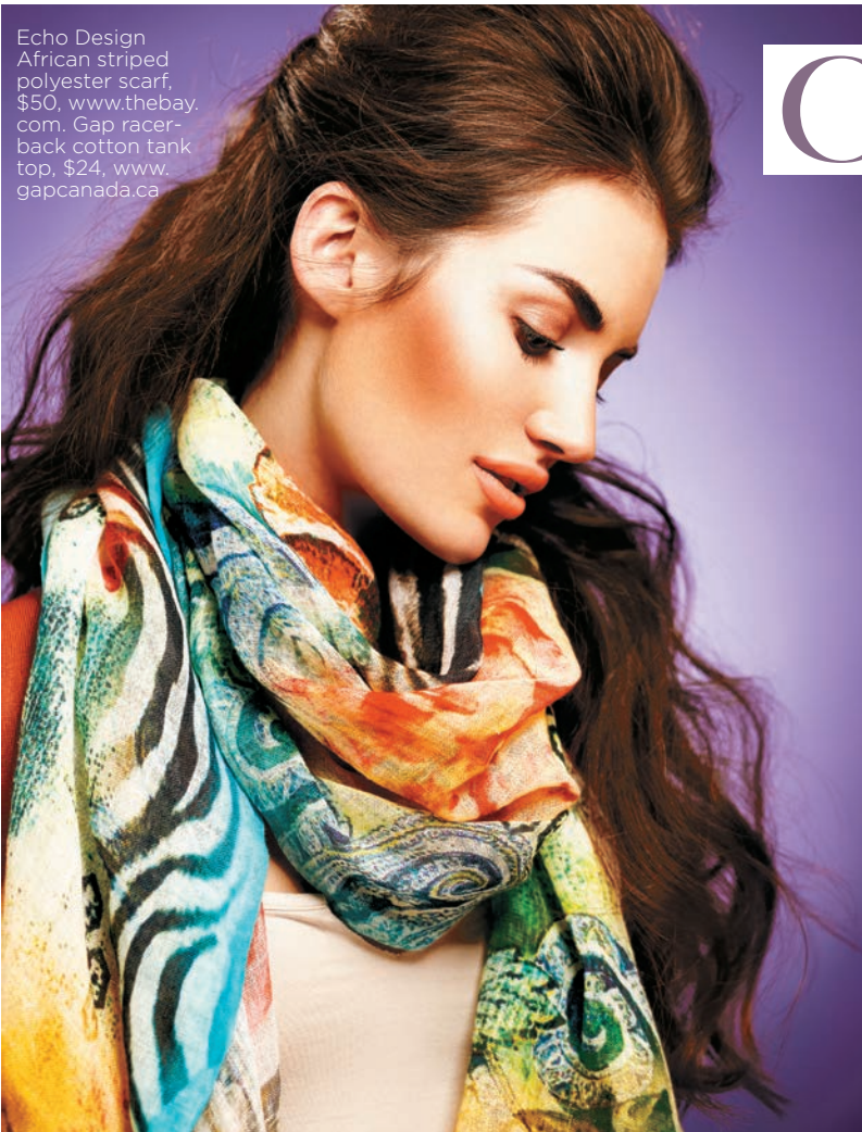
Echo Design African striped polyester scarf, $50, www.thebay.com Gap racer-back cotton tank top, $24, www.gapcanada.ca