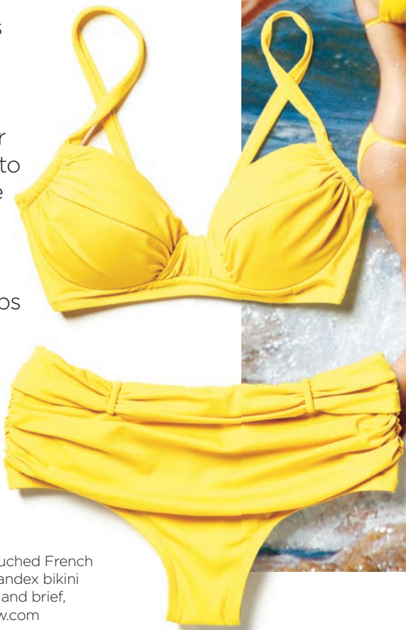
J. Crew ruched French nylon-spandex bikini top, $56, and brief, $58, jcrew.com

The sunny colour is the first thing people will notice, but this bikini boasts a few friendly extras. First, the seams under the bust add extra support, while the molded cup offers additional coverage for when you're getting into a chilly pool. As for the bottoms, the tummy-taming ruched panel offers coverage and helps camouflage lumps or bumps—without having to veer from a classic bikini brief.