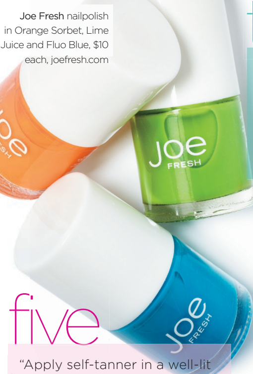
Joe Fresh nailpolish in Orange Sorbet, Lime Juice and Fluo Blue, $10 each, joefresh.com

“When it comes to sunscreens, people often forget their hands and feet. As a result of continuous unprotected sun exposure, those parts of our bodies get pigmentation marks and wrinkles faster than other parts. SPF 30 is your ultimate choice.”— Sam Globa, conceptstoronto.com, Toronto