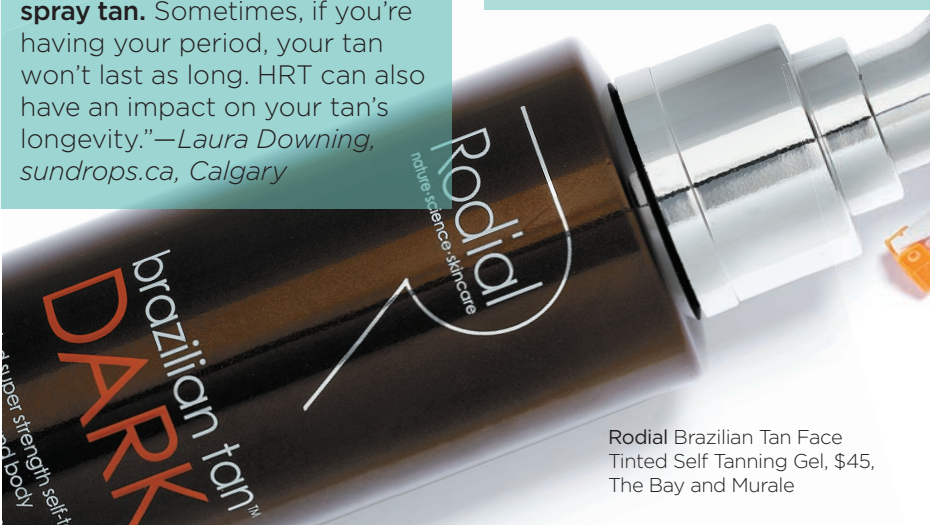
Rodial Brazilian Tan Face Tinted Self Tanning Gel, $45, The Bay and Muraie