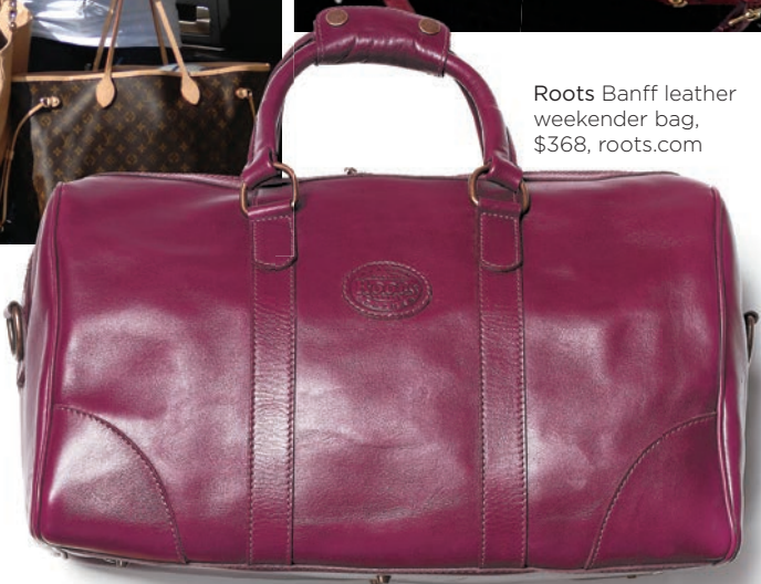
Roots Banff leather weekender bag, $368, roots.com