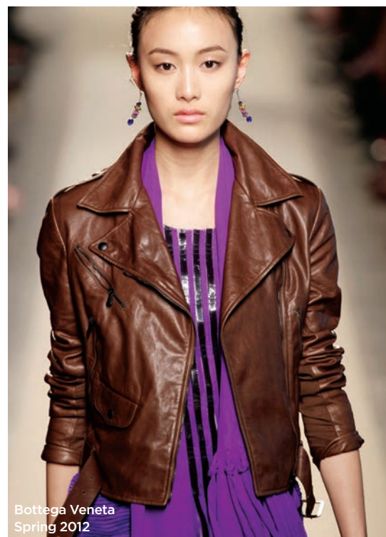
Bottega Veneta Spring 2012