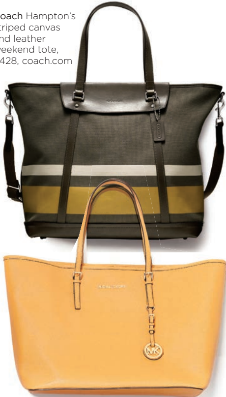
Michael Michael Kors leather Jet Set Saffiano tote in Sun, $295, at Michael Kors boutiques, 866-733-5677