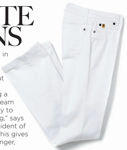
Second Denim cotton-Lycra high-rise bootcut jeans, $110, secondclothing.com