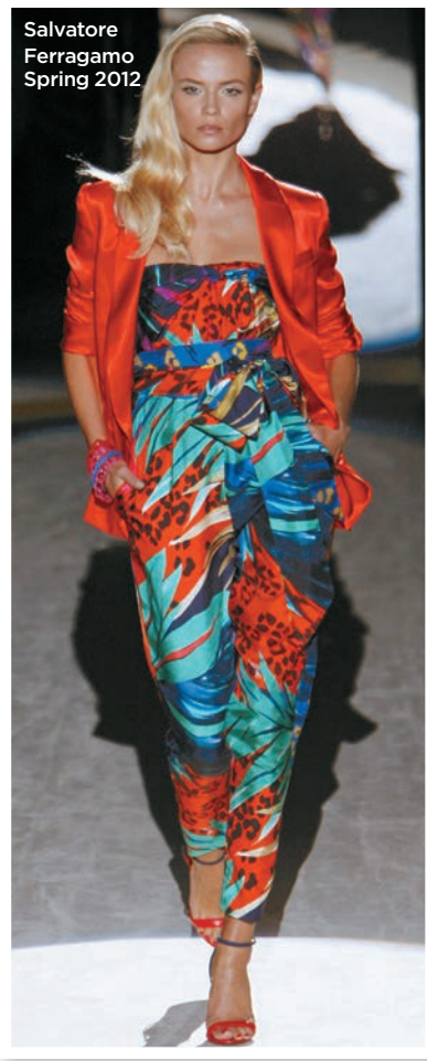
Salvatore Ferragamo Spring 2012

TRY BCBG Max Azria polyester Jacques trousers, $274, bcbg.com. Jacob modal-polyester cropped crew-neck blazer, $79, jacob.ca. Kara Ross gold-plated brass Hexagon earrings, $175, ellehardware.com, thebay.com. Jacob polyester contrast collar blouse, $59, jacob.ca. J.Crew viscose Lia sandals, $276, jcrew.com