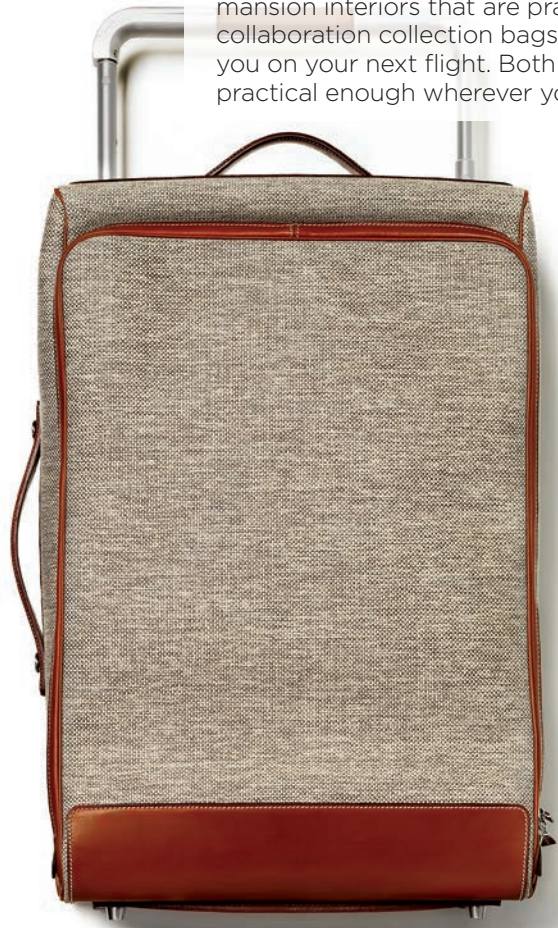
Hermès Calèche Express canvas and leather luggage, $8,000, hermes.com

Your take-it-with-you essential on your next vacation? An expensive-looking carry-on handbag that looks and feels like luxury. And this season's choices just got a whole lot chicer: fashion designer Mary Katrantzou teamed up with French handbag brand Longchamp this spring to create artful trompe-l'œil carry-on handbags, a dreamy collection of colourful art-y purses with hot-air balloons, floating orchids and 3D mansion interiors that are practically ready-to-wear masterpieces. Tommy Ton's latest collaboration collection bags with Club Monaco are also roomy enough to take with you on your next flight. Both backpack and messenger bag look polished and are practical enough wherever your destination. Et bon vol!